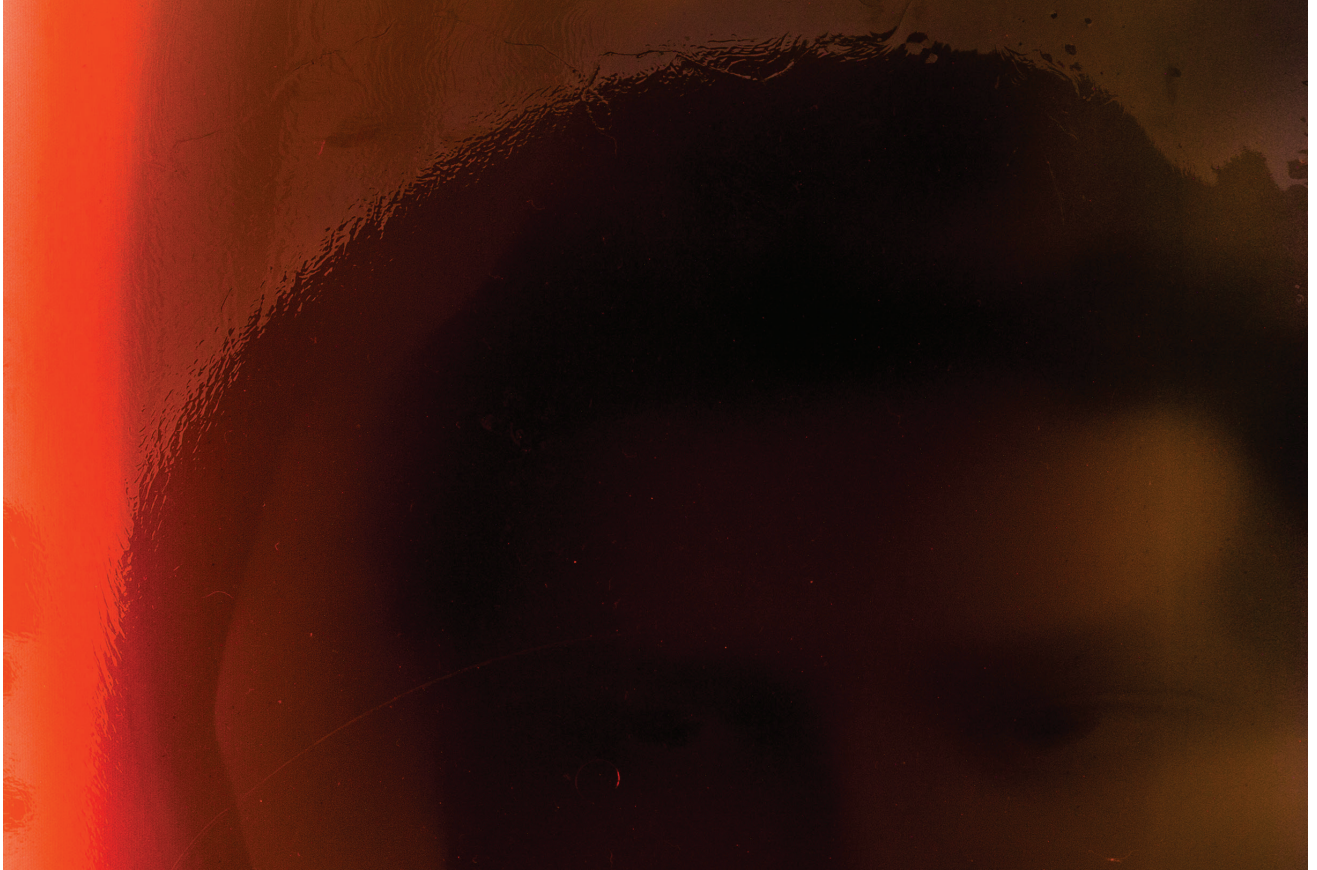
shattered myself into pieces in the act of creating the universe, 2025 - detail

An orange neon light bar, positioned between the canvases, introduces a vibrant energy that delimits the space of the work. This artificial light may allude to the primordial energy that, in the universe, precedes the formation of matter. In this analogy, the colorful pixels on the bases could represent the elementary units of visual information, from which the more complex representations of bodies and memories are constructed.