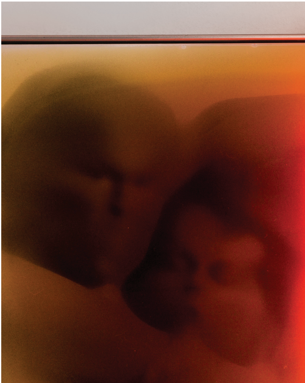
shattered myself into pieces in the act of creating the universe, 2025 - detail

Through these elements, the work invites contemplation on themes such as connection and fragmentation in relationships, the fleeting nature of instants, and the efforts to capture them, even in the face of inevitable dissolution or digitization. shattered myself into pieces in the act of creating the universe proposes itself as a point of inflection for reflection on the complexities of human relationships, the nature of memory, and the continuous processes of deconstruction and reconstruction of experiences.