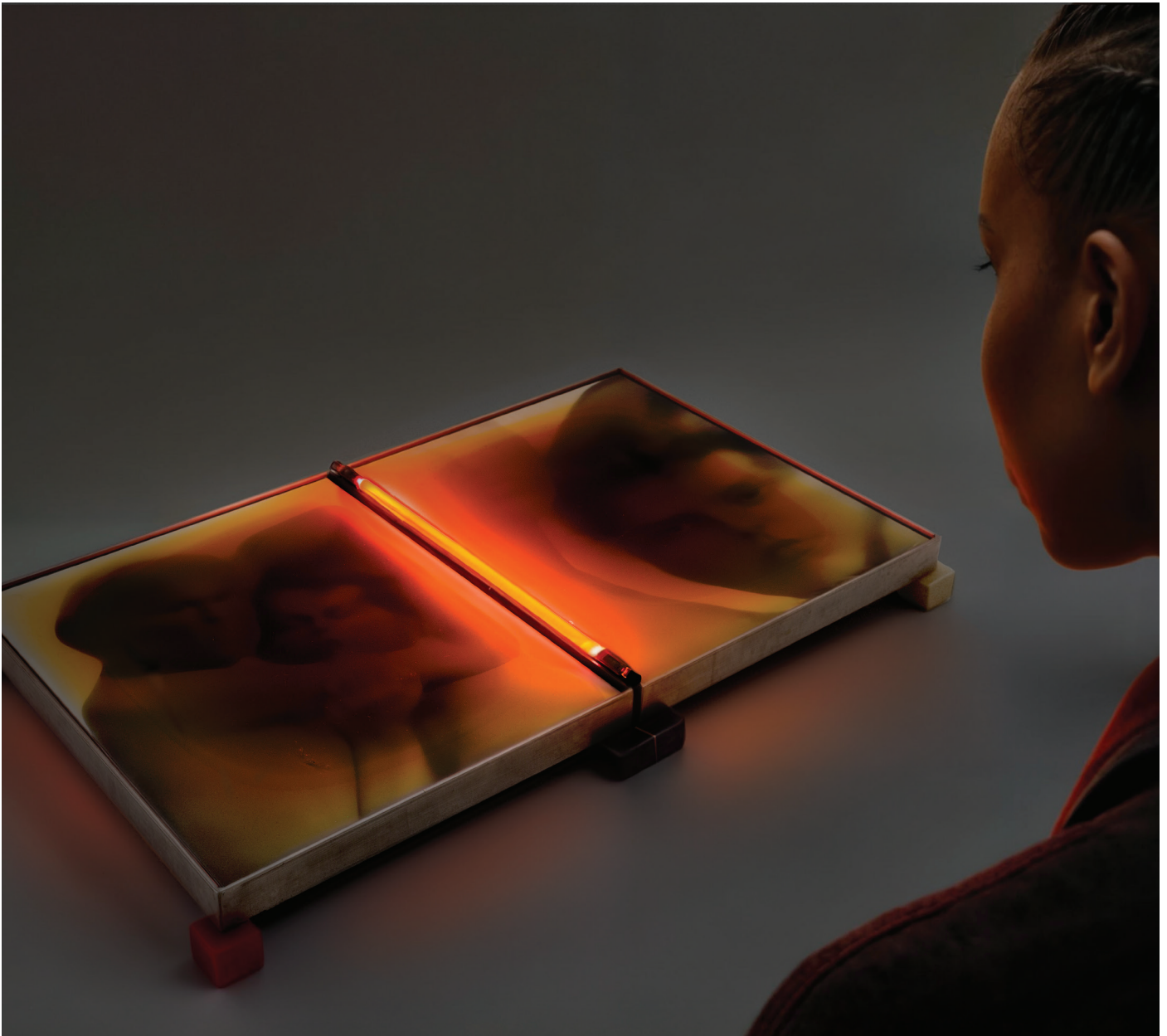
shattered myself into pieces in the act of creating the universe, 2025 - intallation view

Layers of amber-colored resin transform the surface of the canvases where the images reside. Accumulating organically in the center, the resin creates a focal point of greater density and lesser visibility, while its fluid edges blend with the image. This physical intervention, with its fluid and organic texture, not only partially obscures the representations but also acts as a subtle mirror, reflecting the viewer and inserting their presence into the visual dynamics of the work.