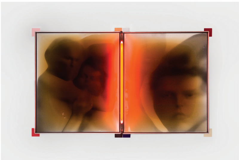
shattered myself into pieces in the act of creating the universe, 2025 - top view