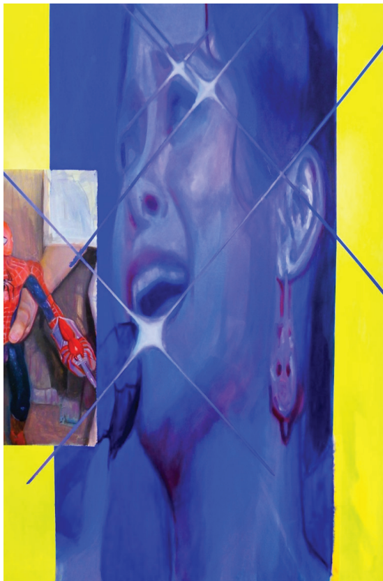
FEATURED LEFT: I'm Filipino but I can't sing (2024) 101 x 152cm, Oil on stretched canvas