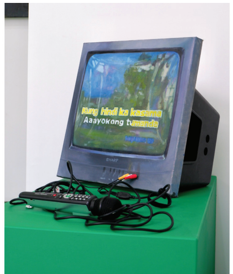
FEATURED ABOVE: I don't want to grow old if I'm not with you