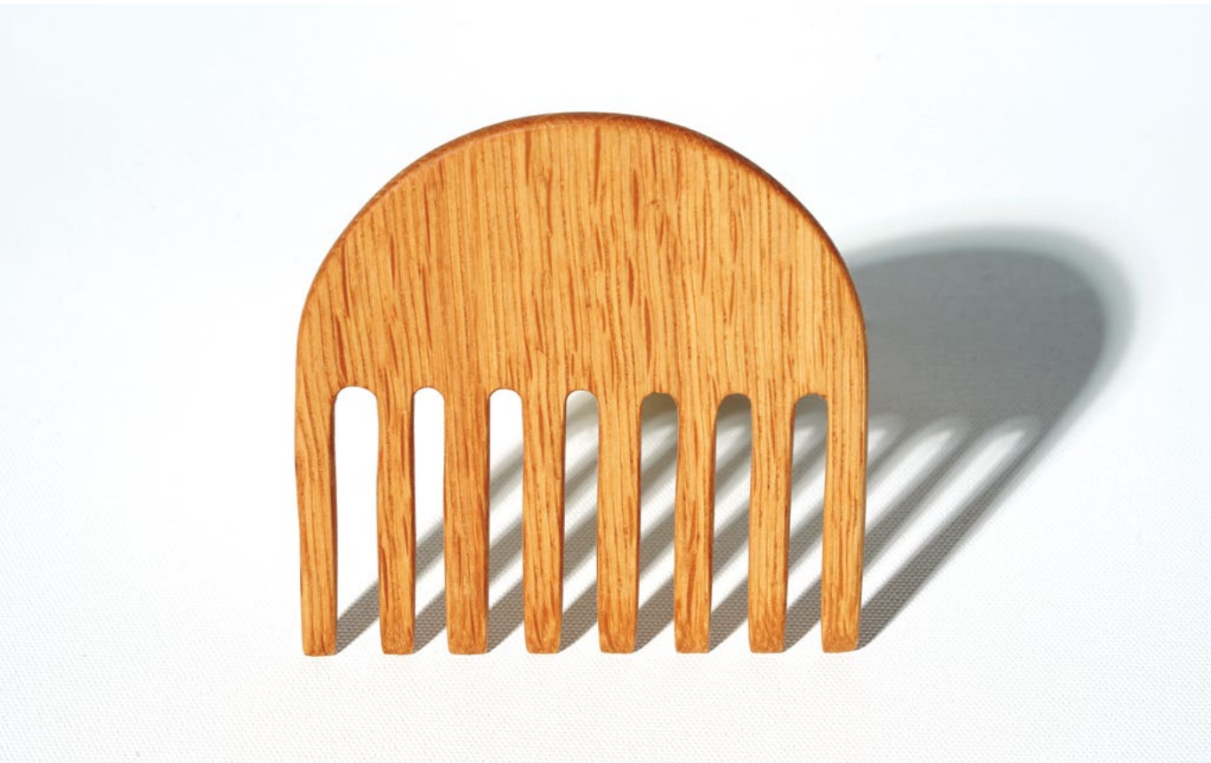
Peineta 2022, oak, 8 x 8 cm