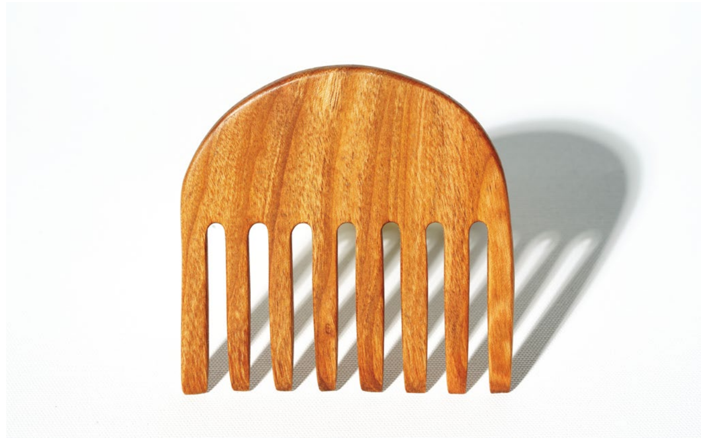
Peineta 2022, cherry, 8 x 8 cm