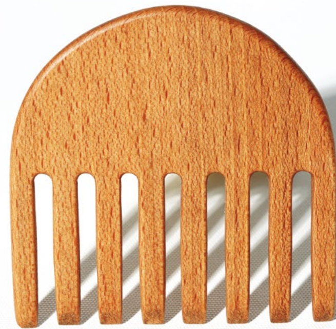
Peineta 2022, beech, 8 x 8 cm