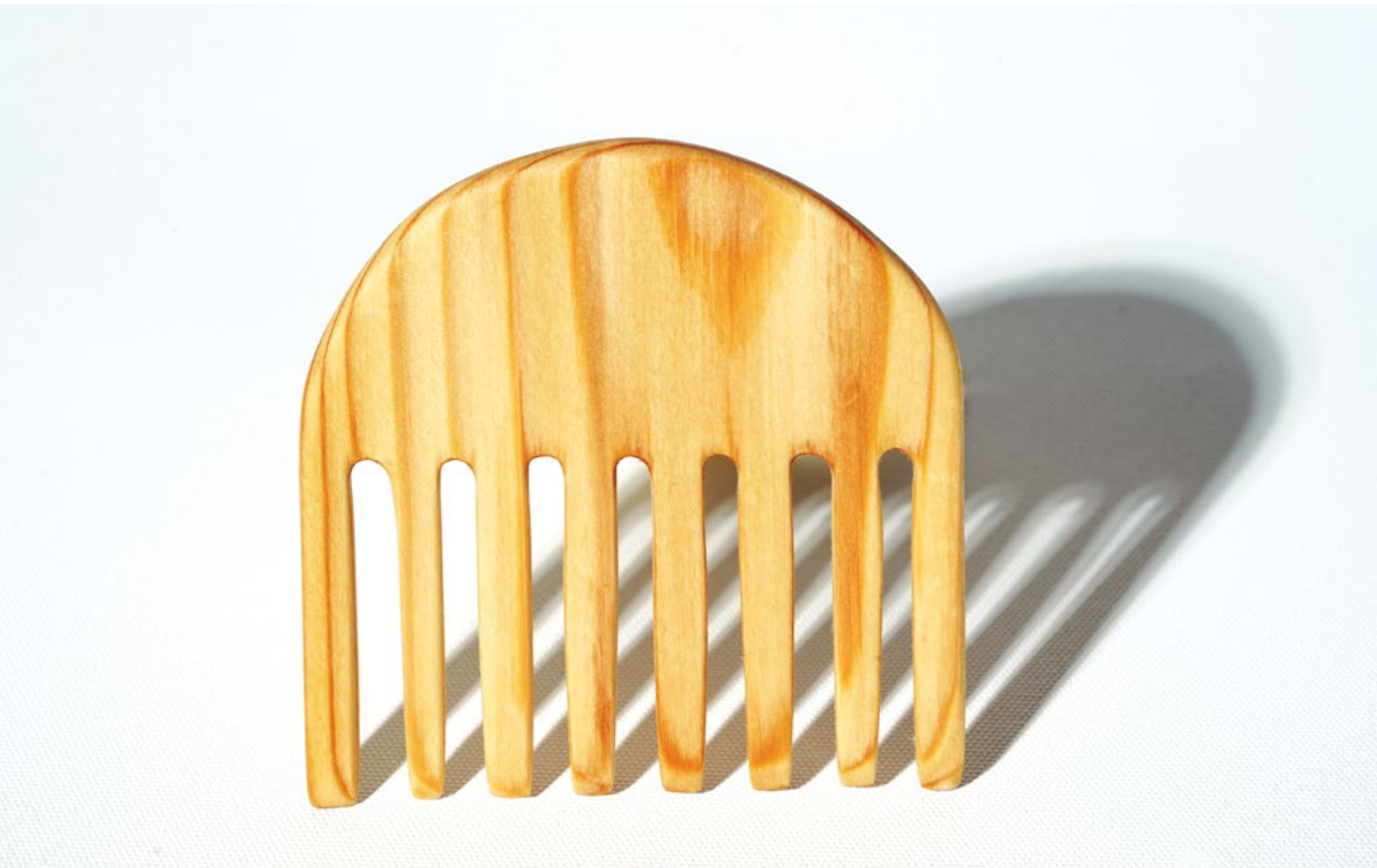
Peineta 2022, spruce, 8 x 8 cm