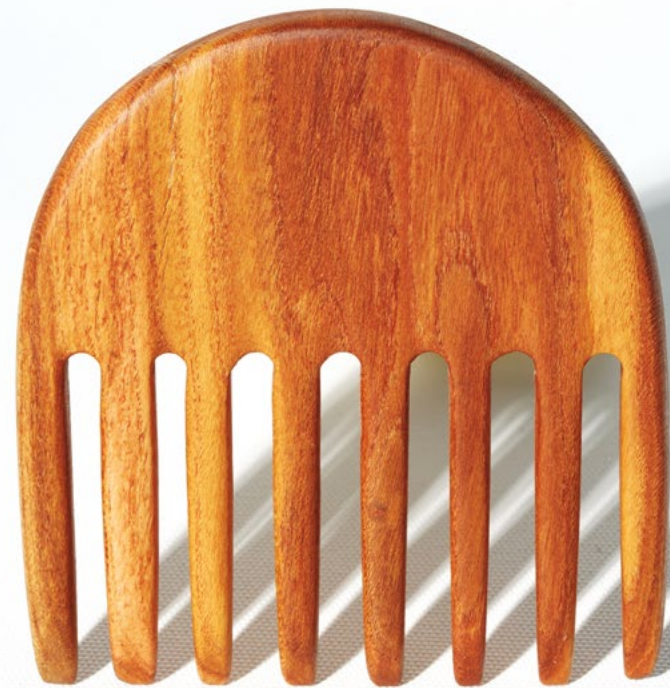
Peineta 2022, almond, 8 x 8 cm