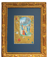
Master of Mary of Burgundy (workshop of), The Resurrection of Saint Lazarus , c. 1480-1485 One illuminated leaf from a Book of Hours (tempera, ink and gold on vellum) 12.3 x 17.1 cm (framed: 26.3 x 32.6 x 2 cm)