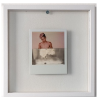
Stuart Sandford, Polaroid Collage LXXIV , 2022 Unique, signed en verso, framed with museum glass 21 x 21 x 2 cm