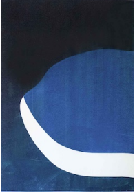
Simon Heusser, Illuminated Home , 2024 Monotype, algae pigment on paper 70 x 99 cm (framed: 77.5 x 107.5 x 3 cm)