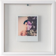
Stuart Sandford, Polaroid Collage LXVI , 2021 Unique, signed en verso, framed with museum glass 21 x 21 x 2 cm