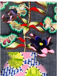
Laura Thiong-Toye, Murmures d'été , 2024 Acrylic and ink on paper mounted on wood 59 x 79 x 4.5 cm