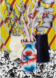
Laura Thiong-Toye, Waiting for summer , 2020 Acrylic and ink on paper, framed 56 x 75 cm (framed: 61.5 x 81.5 x cm)