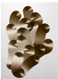
Audrey Julien & Arno Mathies, Print 038 Olive Gold , 2024 Unique print on paper 70x100 cm (framed: 72.5 x 102.5 x 3 cm)