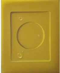
Harald Erath, Dank Gold , 2024 Egg tempera on canvas 24 x 30 cm