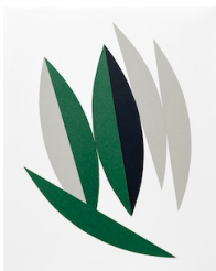
Tetiana Kartasheva, They Came Unnoticed I , 2024 Origami paper collage, framed 22 x 28 cm (framed: 26 x 32 x 3 cm)