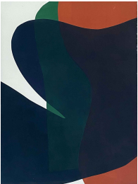
Simon Heusser, Formula of Three , 2024 Monotype, algae pigment on paper 57 x 75 cm (framed: 61.5 x 81.5 x 3 cm)