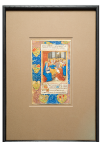
Parisian illuminator (follower of Étienne Colaud), The Pentecost , Realized in Paris, c. 1520 One illuminated leaf from a Book of Hours (tempera, ink and gold on vellum) 9.6 x 13.6 cm (framed: 26.5 x 37.5 x 2 cm)