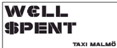
WELL $PENT V.I.P. Taxi