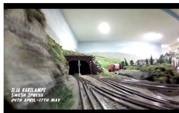
SweSh Xpress Geneve Trailer