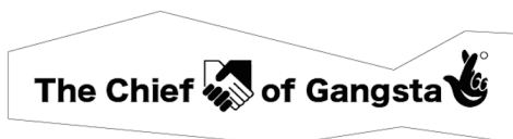
The Chief Dean of Gangsta Shape