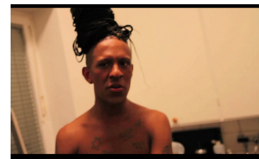
WELL $PENT: Mykki Blanco in Malmö