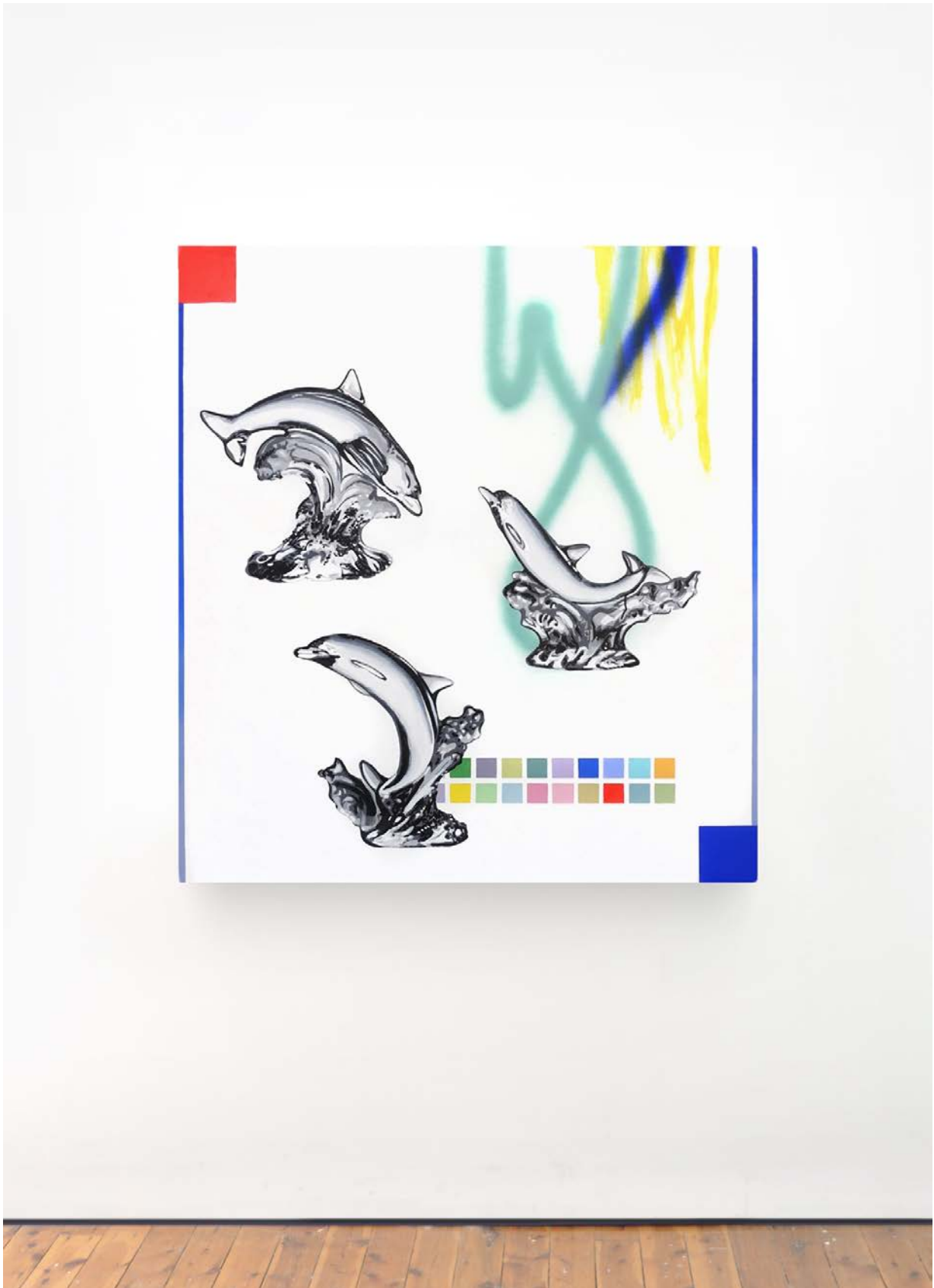
Genevieve Felix Reynolds Uriel (hanging) 87x102cm, flashe and acrylic on canvas, 2022 $4000