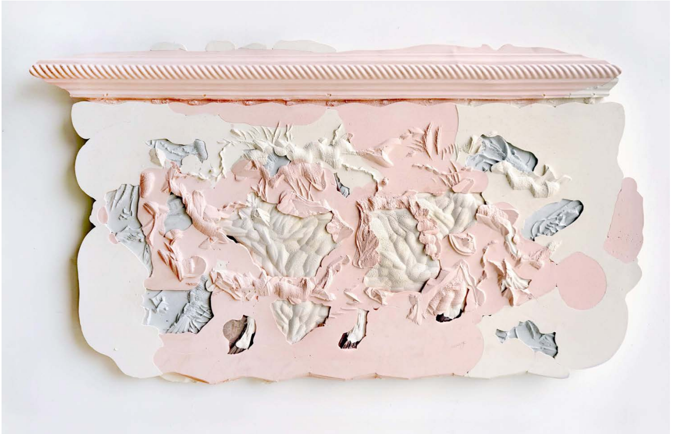
Bruce Reynolds Bull in Pink 66 x 116cm 2021 $4400