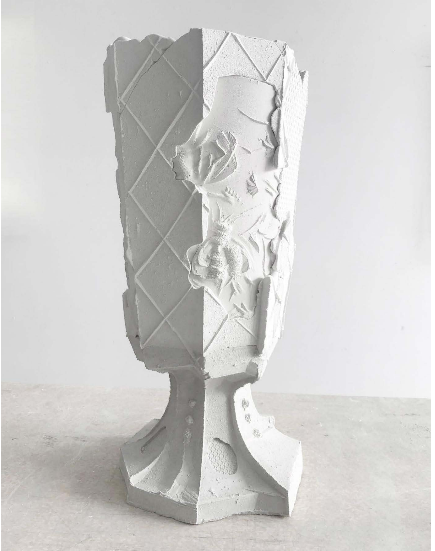
Bruce Reynolds Language Vessel #1 65 x 30 x 30cm 2022 $3600