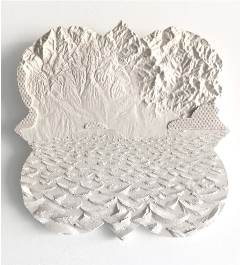
Bruce Reynolds Migration 34 x 34cm 2018 $2500