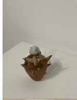
Moyan Wang , Pricks I, 2025 wood-fired ceramics 10 x 7 cm unique CHF 70