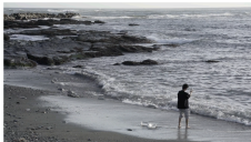
Zeyuan Ren , A Kind of Displacement, 2021 Single channel HD video with color and sound 06'08" 1/3 + 1 AP CHF 1'200

Zeyuan Ren (b. 1997) is a Chinese video, performance, and installation artist working between Shanghai and Ningbo. Ren holds an MFA in Photography from Rhode Island School of Design. Spanning lens-based media, installation and performance, his practice is rooted in the composite experiences of displacement between coasts, ruminating on liminality in the context of historical and geographic specificity. His recent research concerns the imaginary lines charted by the West in the waters of the Yangtze River estuary during the 19th century, and the concrete representations of imperial optics. Ren's practice reflects on displacement, movement, and liminality, often emerging from intuitive actions rather than predefined concepts and his works have been exhibited and screened at venues including Fotografiska Shanghai, University of Nottingham-Ningbo, Guangdong Times Museum, Alchemy Film and Moving Image Festival, de Young Museum and Microscope Gallery. He was the finalist of the Three Shadows Photography Award and the UCCA Lab X Perrier Emerging Artist Program.