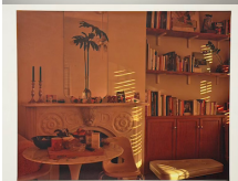
Ronghui Chen , Untitled 16 (study room), 2019 Archival Pigment Print

76 x 95 cm, edition 3/3, CHF 4'400 112 x 140 cm, edition 1/2, CHF 3'400