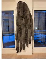
Moyan Wang , The Fallen Moon, 2025 Urushi lacquer, cotton, ceramics, pearls approx. 229 x 76 cm unique CHF 300