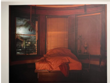
Ronghui Chen , Untitled 09 (bed), 2019 Archival Pigment Print

76 x 95 cm, edition 1/3, CHF 2'800 112 x 140 cm, edition 1/2, CHF 3'400