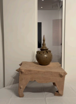
Moyan Wang , A Veil of Rain, 2025 ceramics, papier-mâché, acrylic and eggshell powder unique CHF 300