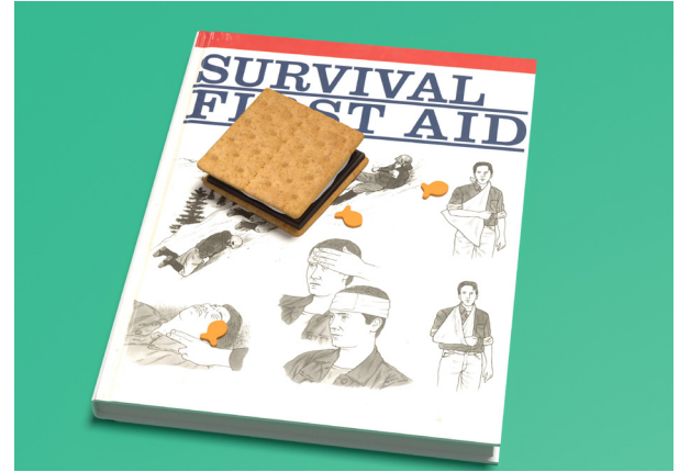
Survival Tamara Johnson & Trey Burns Cement, epoxy putty, acrylic transfer, acrylic paint 21.6 x 26.7 x 34.3cm 2022