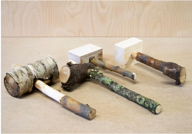
Deadwood Mallet 1,2,3,4 James Ackerley & Niki Colclough Branches collected along the river Irwell 30 x 10 x 4cm 2022