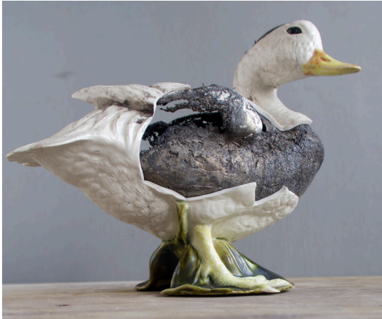
Duck David Clarke Ceramic & patinated pewter 25 x 10 x 15cm 2024