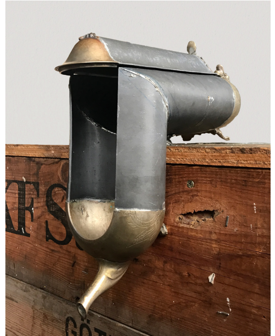
HULLABALOO David Clarke Brass & lead 35 x 15 x 30cm 2024