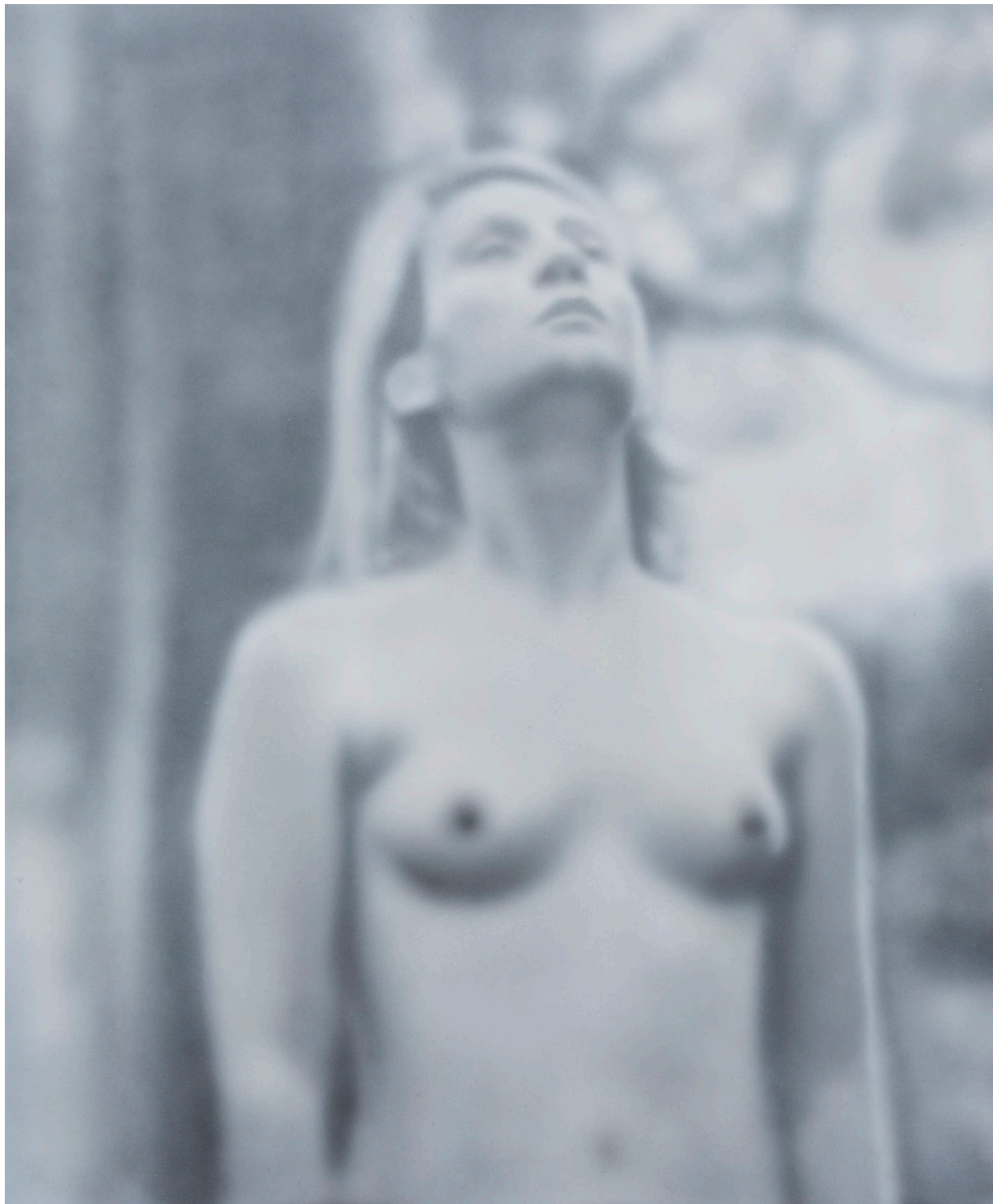
Fiona Lowry you can't change the way I feel 2018 acrylic on canvas 92 x 76 cm $9,000