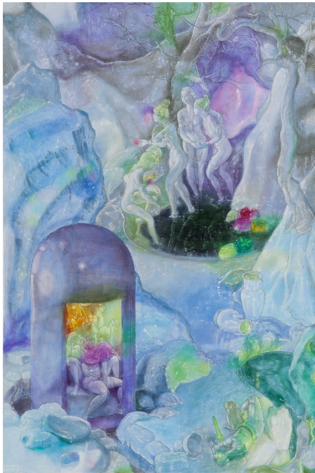
Samuel Quinteros Luminous Night III 2018 ink, acrylic and oil on linen 91.4 x 61 cm $5,900