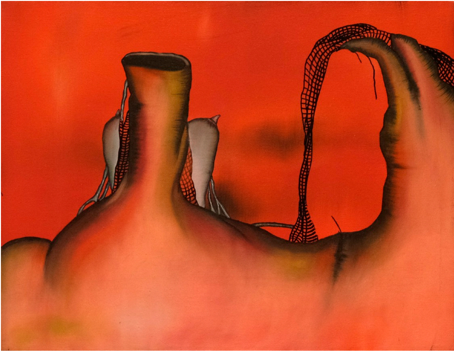
Ron Adams, Transcendental Meditation , 1995, oil on canvas, 30.5 x 40.5 cm, framed, $5,000