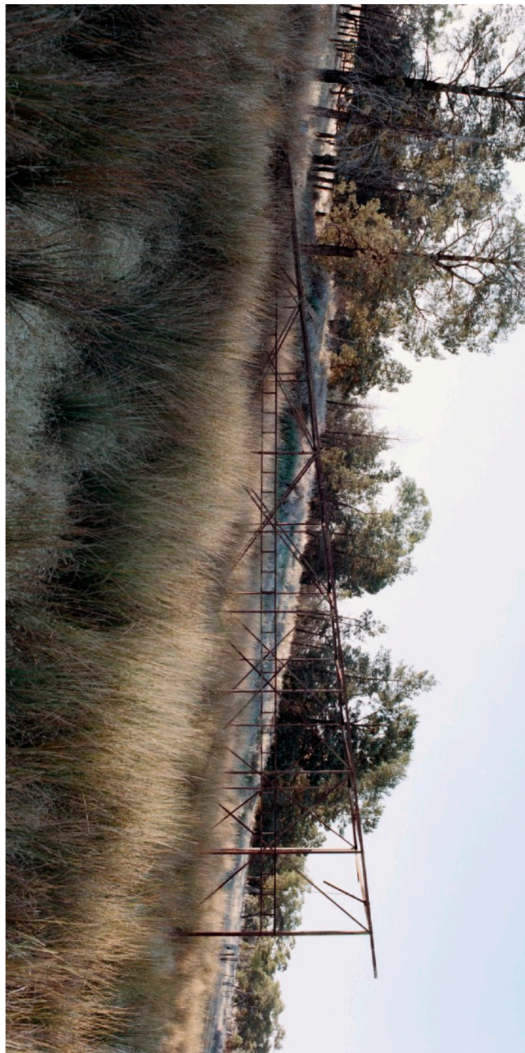
Craig Bender Ballad of the New World I 2012 C-type print 200 x 100 cm (framed size - 207 x 109 cm) edition 1 of 7 + 2 AP $2,800