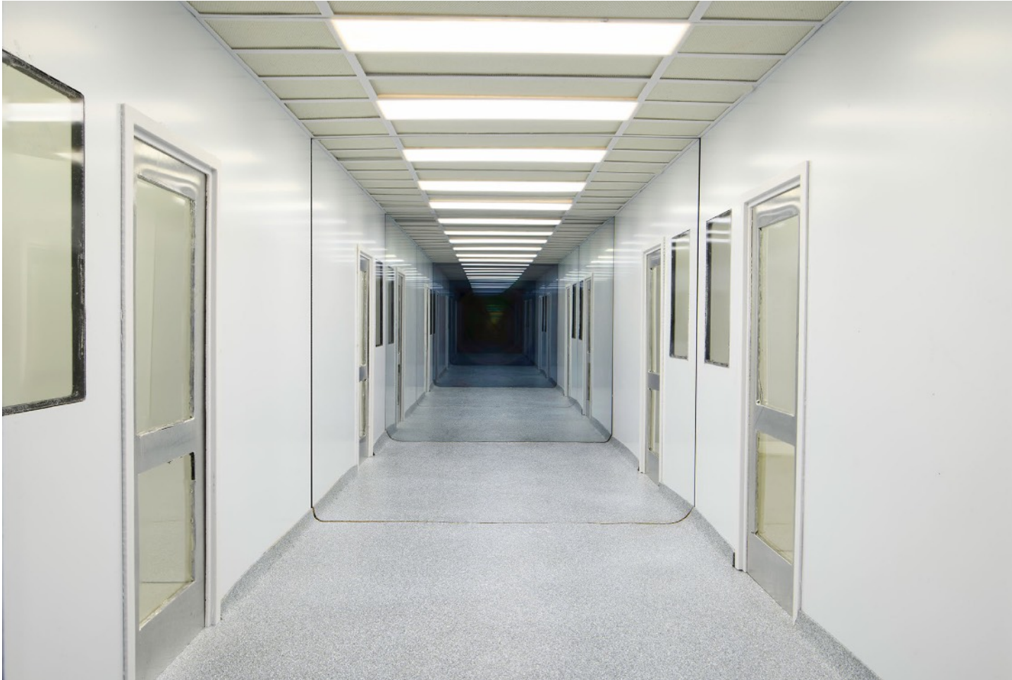
David Lawrey & Jaki Middleton, The end is in the beginning , 2019 timber, glass, polylactide, paint, cork, ABS plastic, light emitting diodes, paper, 40 x 40 x 30 cm. NFS