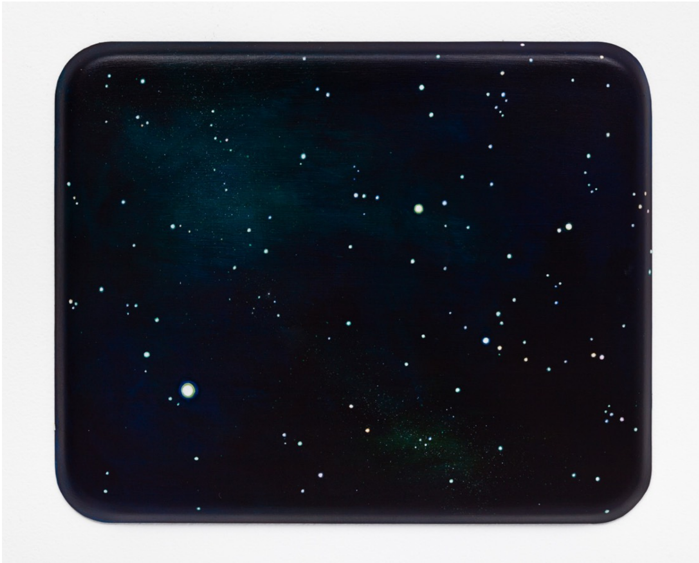
Adam Norton, Deep Space Window I , 2016, synthetic polymer & enamel paint on aluminium, 42 x 52 cm. Private Collection.