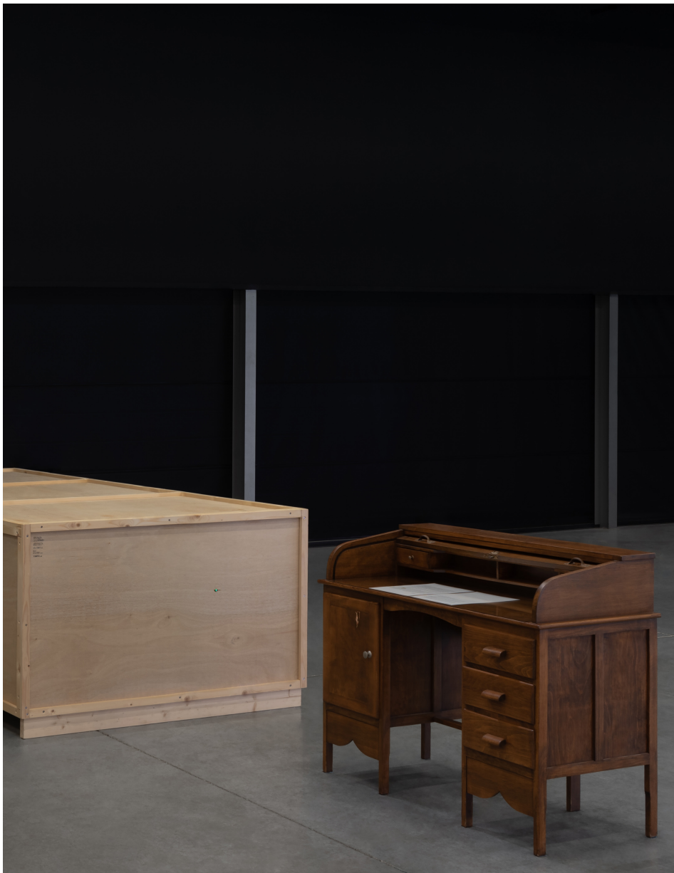
mixed media installation consisting of two engraved wooden crates*, green laser projection, bureau secretaire, Art-deco teapot and an inkjet print on paper with remains of Anastasia Kusmi tea (O-ring shape) *147.00x190.20x106.50cm & 76.00x300.46x137.00cm