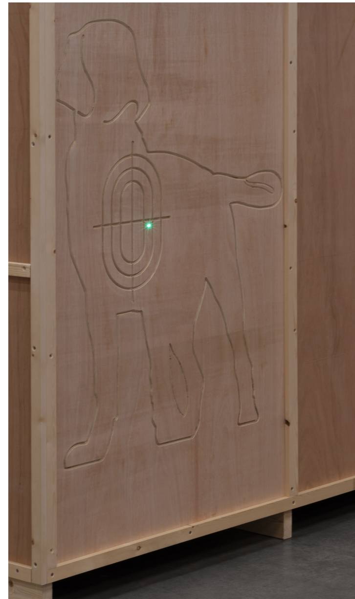
An invitation, and a stage set that could be dismantled at any moment. This, I believe, is what Yves Montand meant when he (I am assuming that the letter is genuine) stated that the conventionalised shell disappeared to hold Paolozzi's Newton .