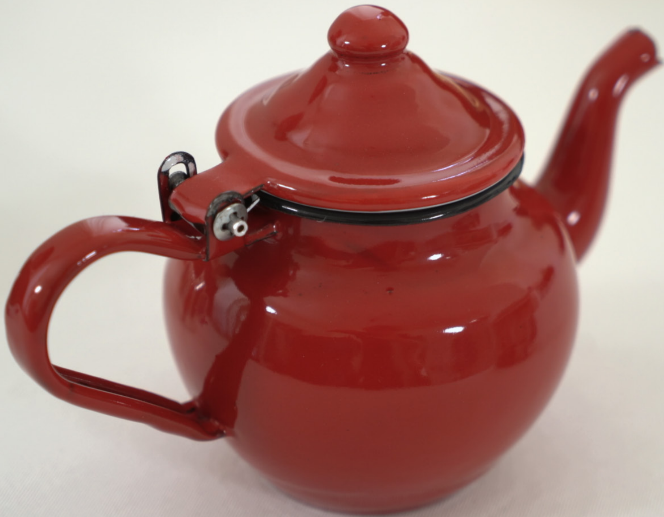
a conversation with Atom Egoyan (2023-2024)