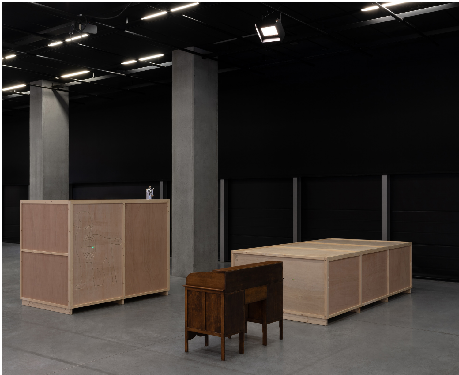
Dogs in Cars are a Dying Breed - (proposal for a) theatrical adaptation (2022-2023)