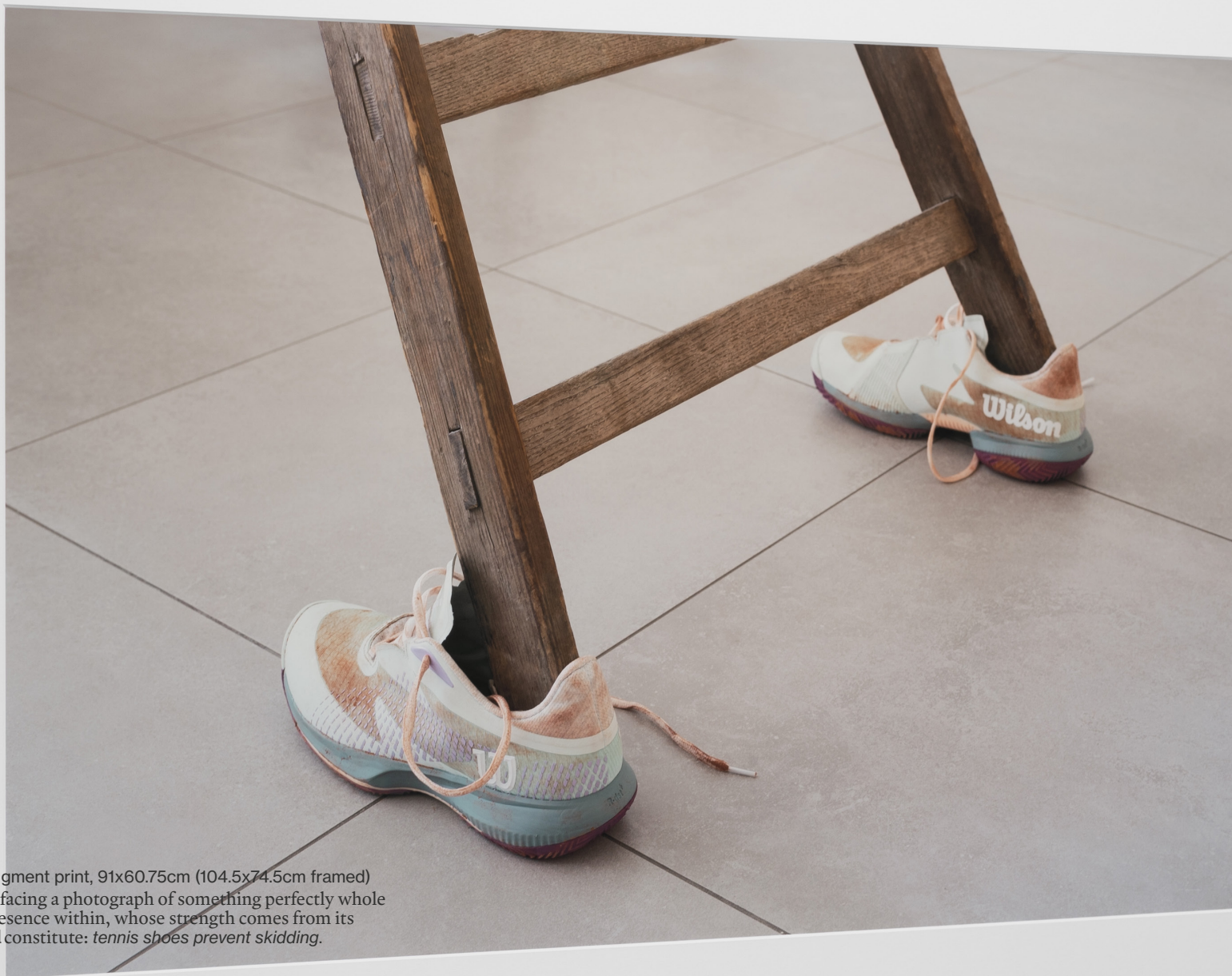
untitled (2023-2024) - archival pigment print, 91x60.75cm (104.5x74.5cm framed) In short, you are, for a moment, facing a photograph of something perfectly whole and stable, a coherent human presence within, whose strength comes from its source — a makeshift that would constitute: tennis shoes prevent skidding.