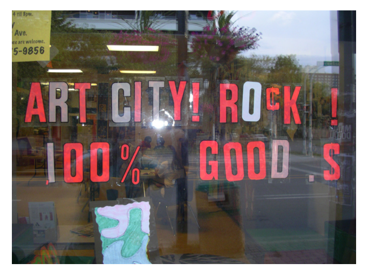
Art City window display circa 2007