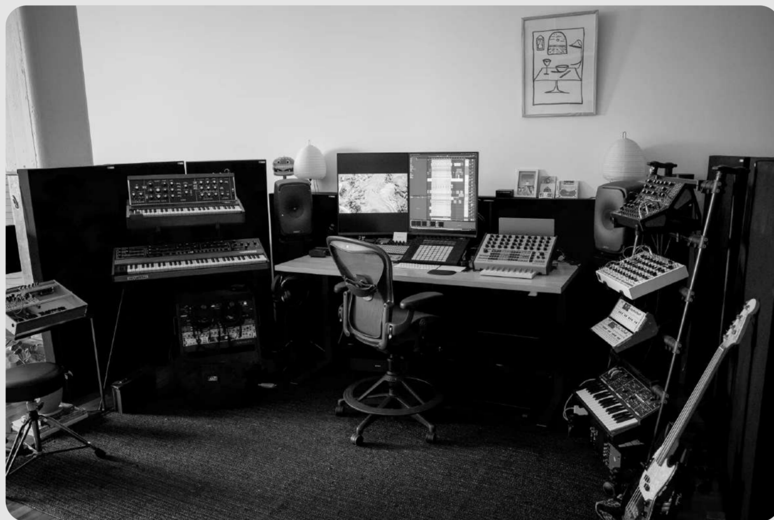
NOSAJ THINGS STUDIO

"i think everyone on the record were artists i was already listening to for several years, so it was almost like this was the cast in a movie i had in mind... so i just kind of already knew that it was going to work and fit."