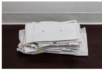
Untitled Paper, plastic, fabric, screws 19 x 13 x 4 inches 2024