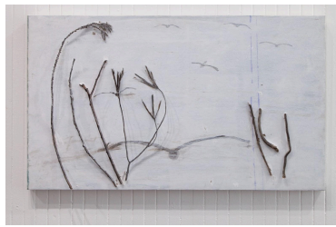
Untitled Acrylic, glue, branches on canvas 40 x 28 inches 2024