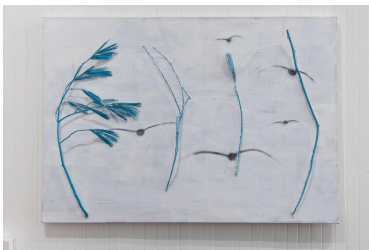
Untitled Acrylic, glue, branches on canvas 39.5 x 24 inches 2024