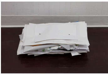
Untitled Paper, plastic, fabric, screws 19 x 13 x 4 inches 2024