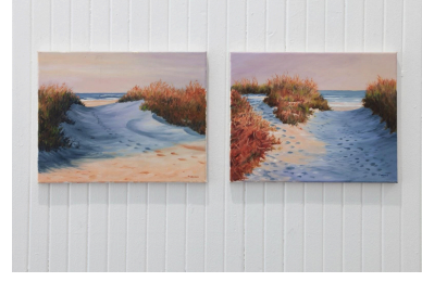
Untitled Paintings 30 x 11 inches 2024