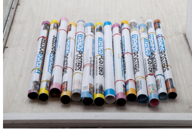
Untitled 14 posters, tape, rubberbands 25 x 21 x 1.5 inches 2024