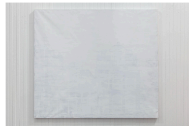
Untitled Acrylic on vinyl print 55 x 48 inches 2024