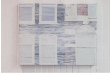
Untitled Acrylic on vinyl print 16 x 20 inches 2024