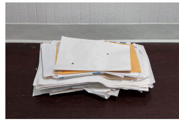
Untitled Paper, plastic, fabric, screws 19 x 13 x 4 inches 2024