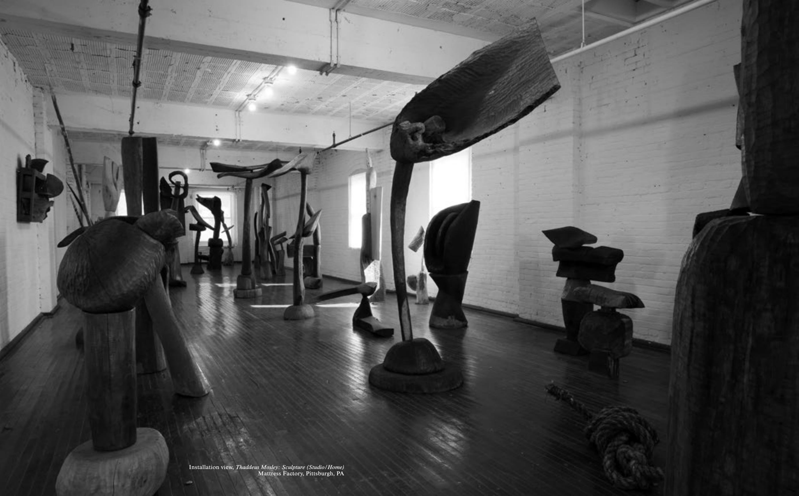
Installation view, Thaddeus Mosley: Sculpture (Studio/Home) Mattress Factory, Pittsburgh, PA