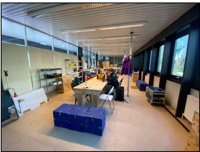
Atelier space, this is where the residency will mostly take place.