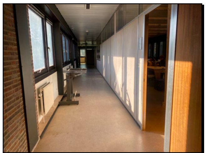
Entrance to the atelier through the left wing. (door width: 83.5 cm)