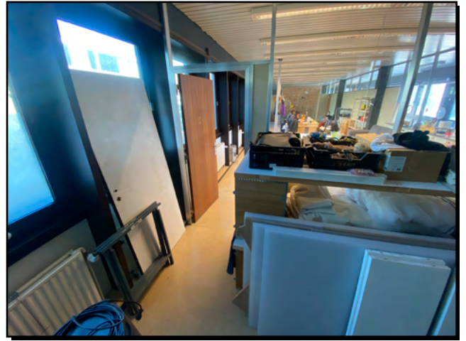
Door from stock room to atelier. (door width: 83.5 cm)