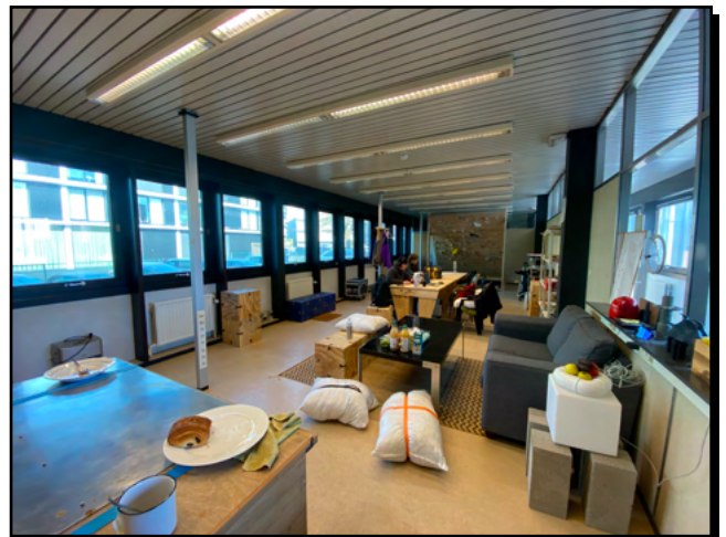
Lounge area inside the atelier.