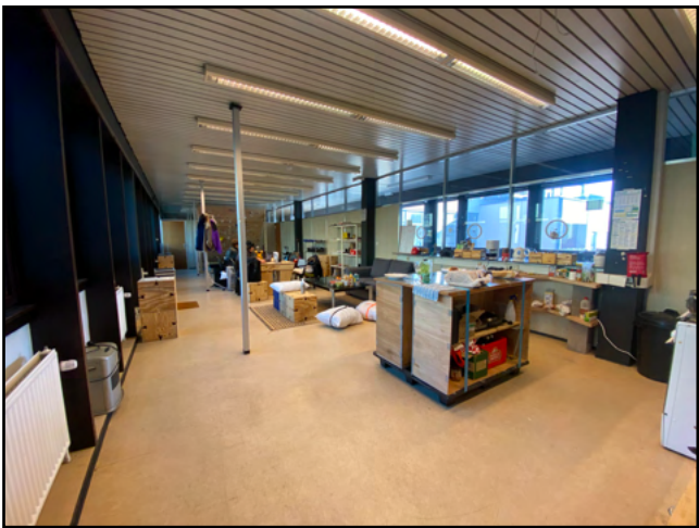
Inside the atelier.