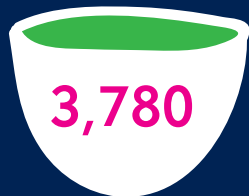
Healthy Meals Served