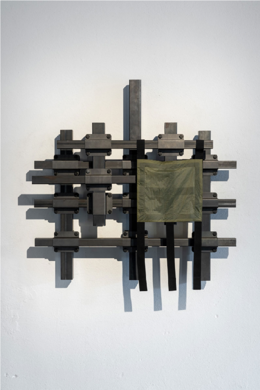
ANM_05_1/1_CL_21, 2021 Iron bars + Nylon Fabric / 100x100cm Unique