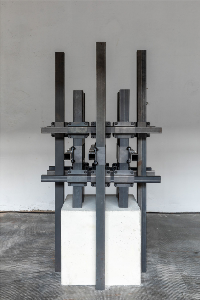
ANM_10_1/2_TR_21 Iron and concrete / 75x150x75cm Unique