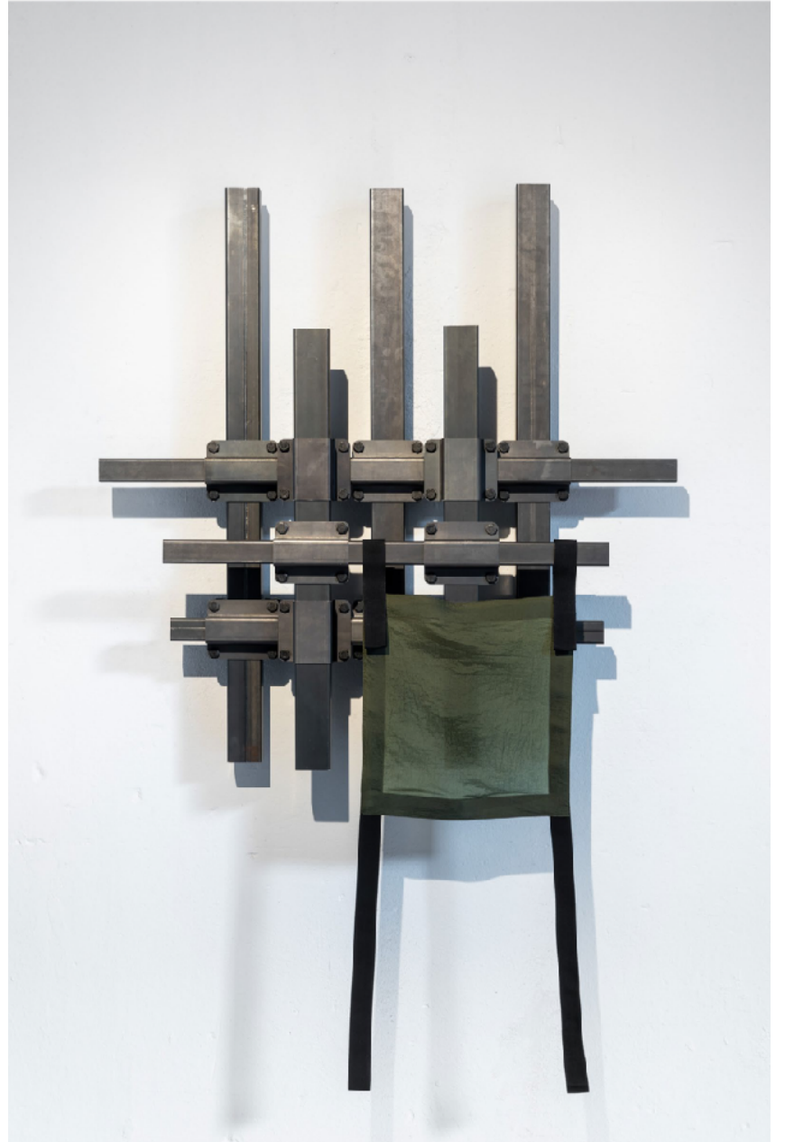
ANM_06_1/1_CL_21, 2021 Iron bars + Nylon Fabric / 100x100cm Unique