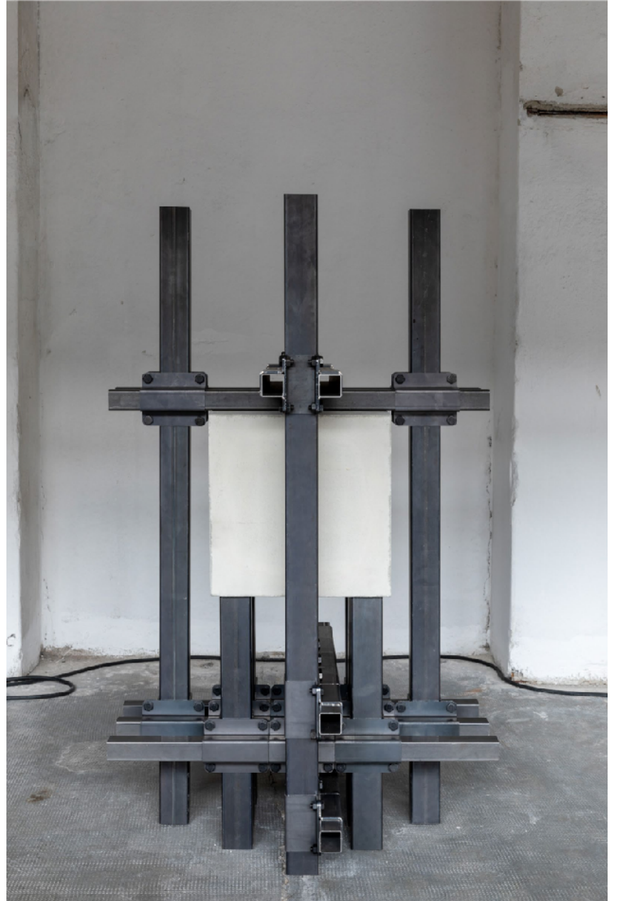
ANM_10_2/2_TR_21 Iron and concrete / 75x100x75cm Unique