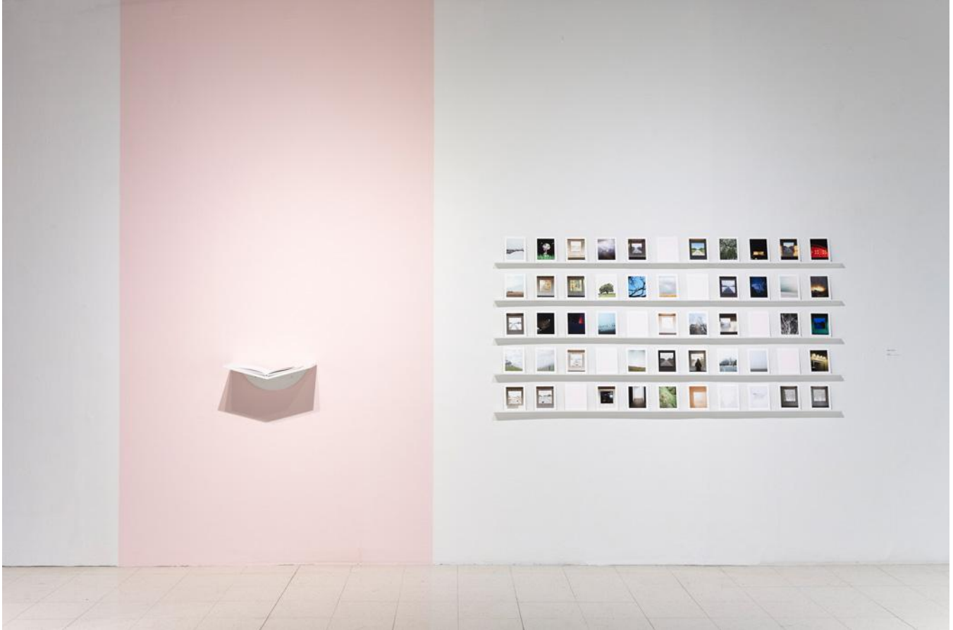
Installation View, Ohio University Art Gallery, 2023