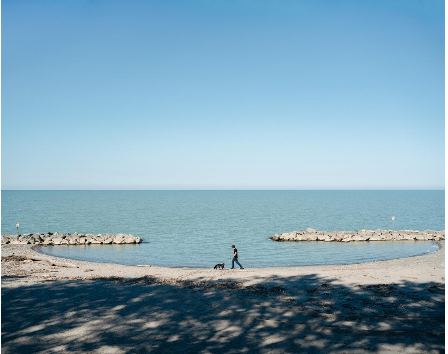
Monday Afternoon, 2022 Pigment Print, 32x40in