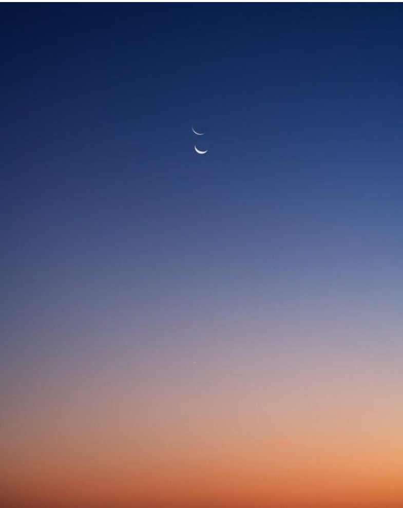
Moon, 2022 Pigment Print, 20x16in