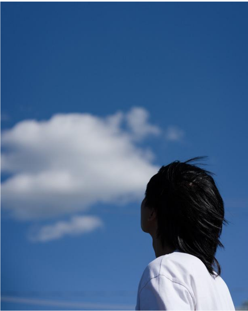
Cloud 2022 Pigment Print, 20x16in