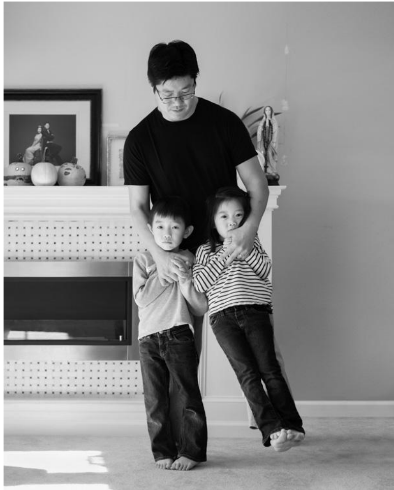
Asian American, 2014 --2017 Pigment Print, 30x40in