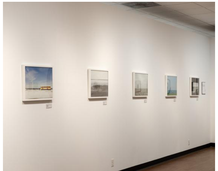
Installation View, The Gallery at Lakeland, 2023 Kirtland, Ohio