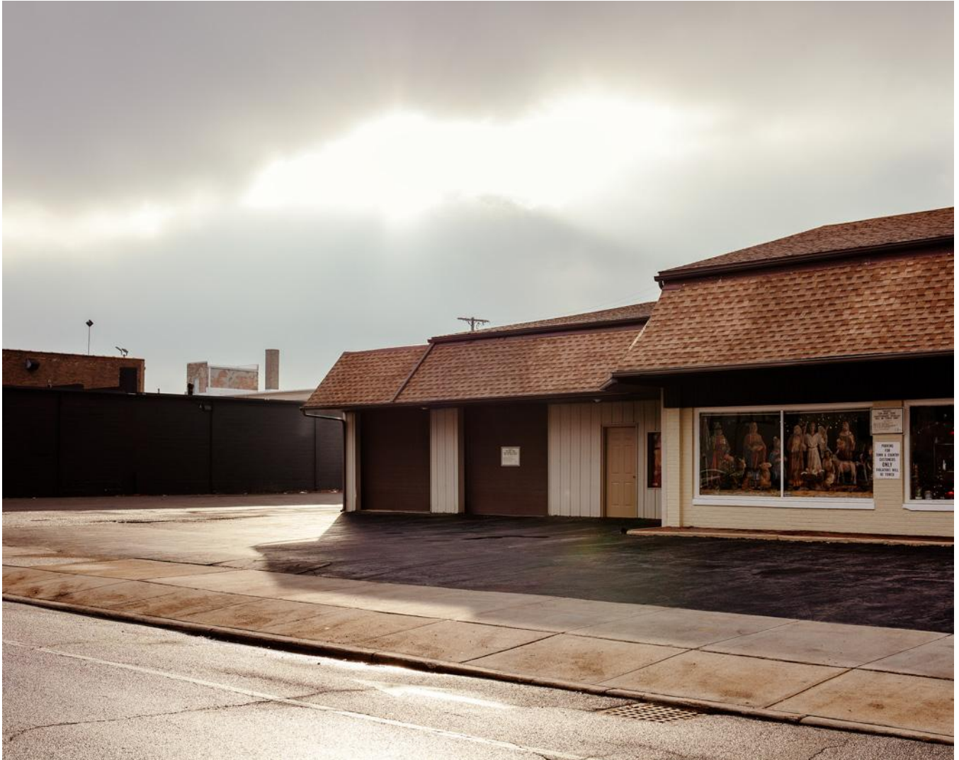
Store, 2023 Pigment Print, 24x30in