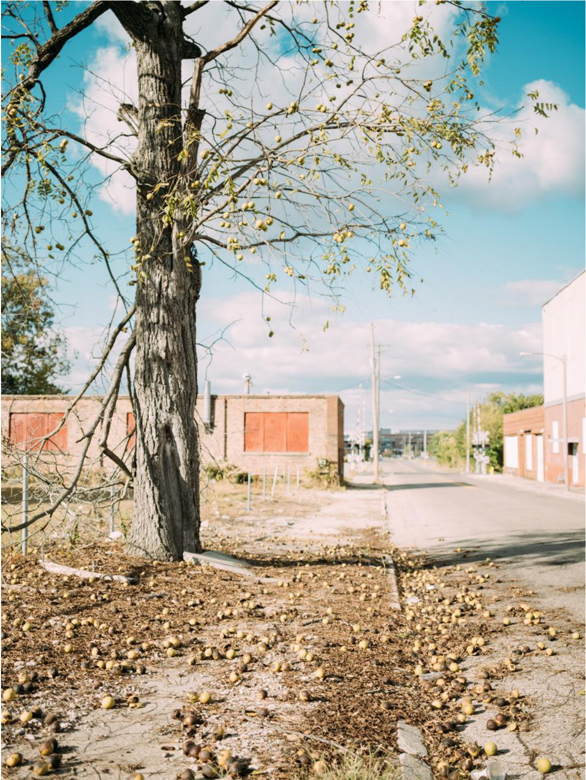
Pear Tree, 2023 Pigment Print, 40x30in