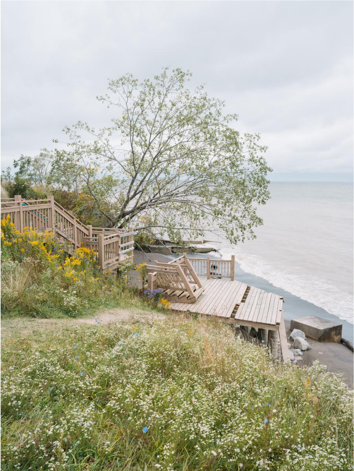
Pear Tree, 2023 Pigment Print, 40x30in