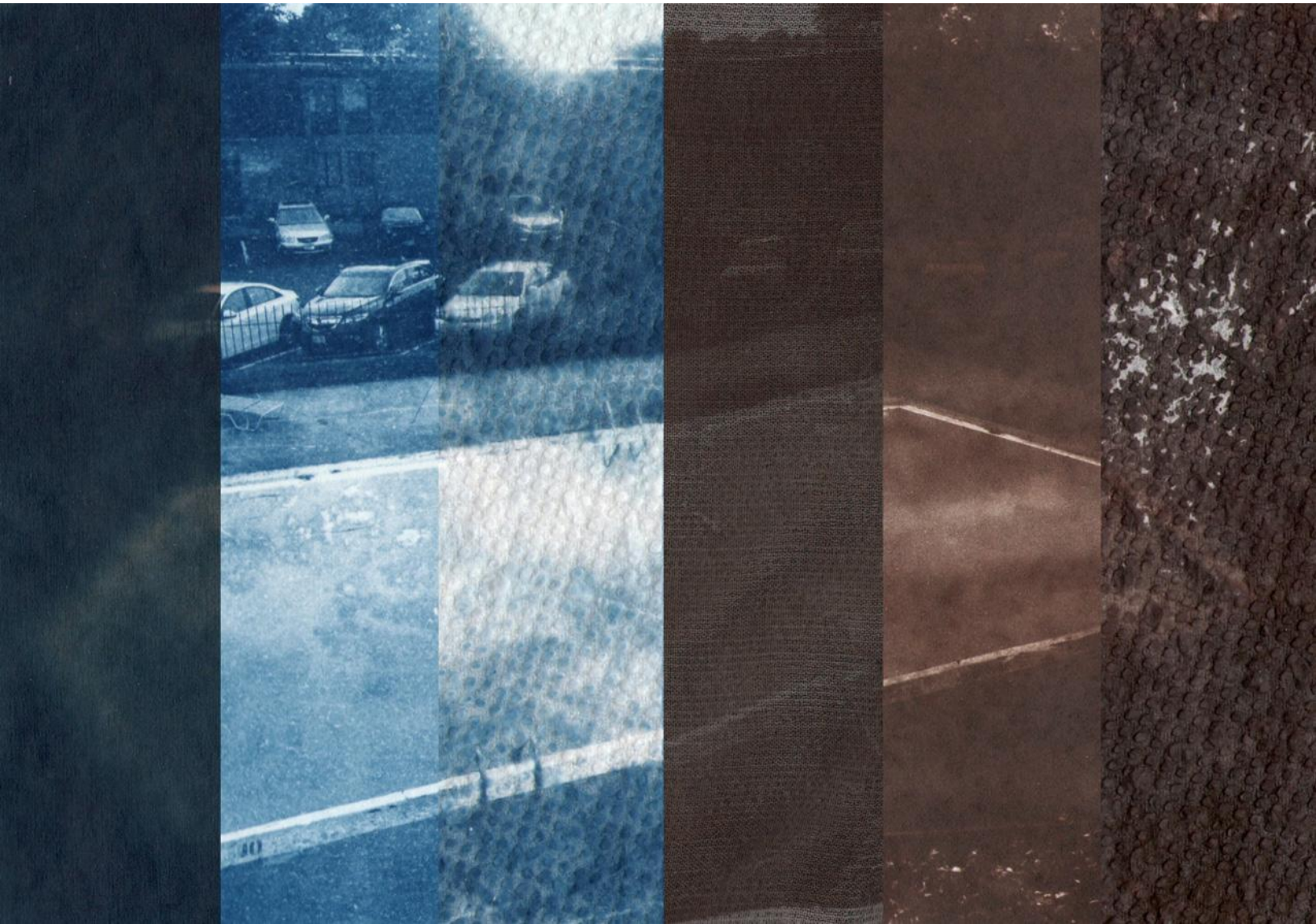
Details, Pool , 2018