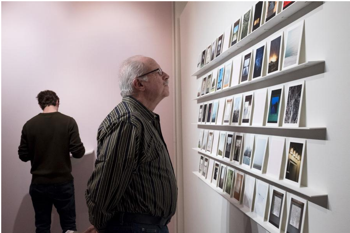
Installation View, Velleity