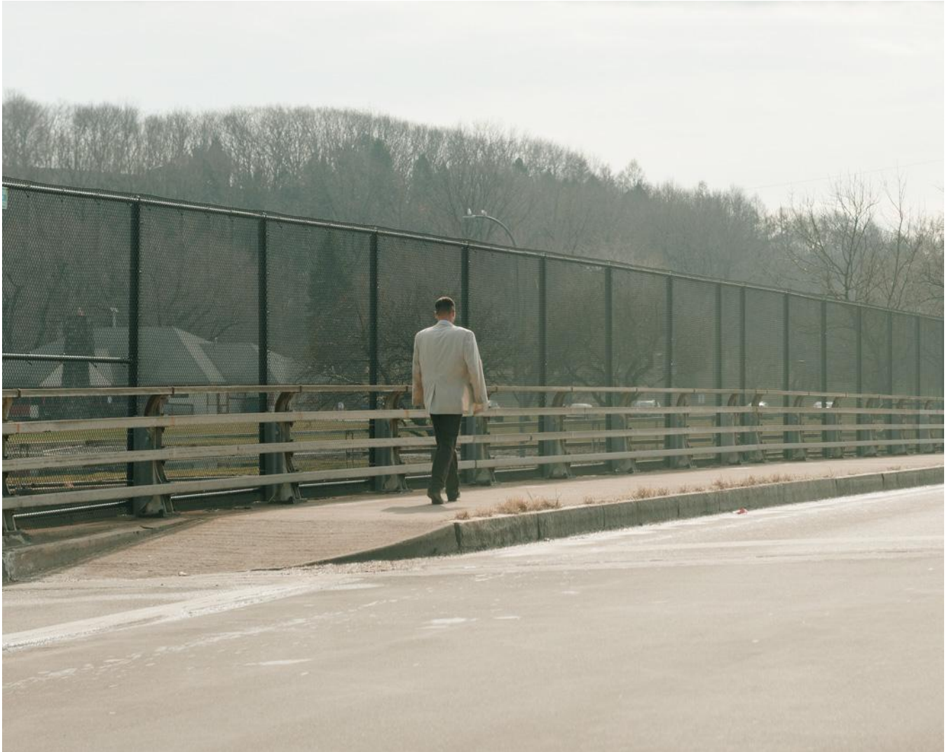
Man on the street, 2022 Pigment Print, 16x20in