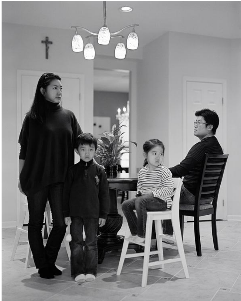
Asian American, 2014 --2017 Pigment Print, 30x40in