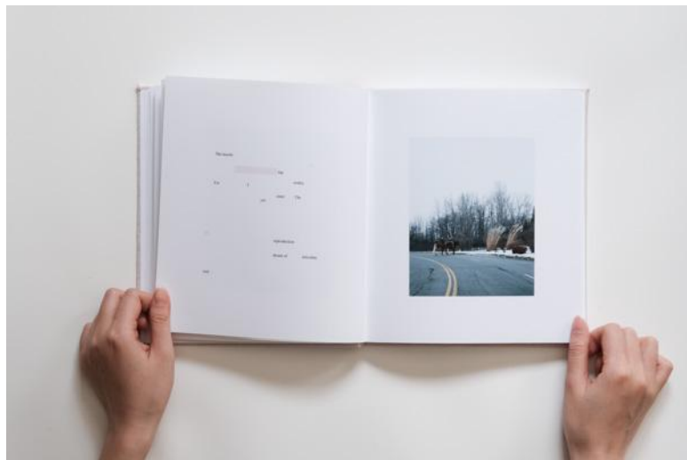
Open book, handmade photobook 8x7in, 60 pages Velleity, 2018