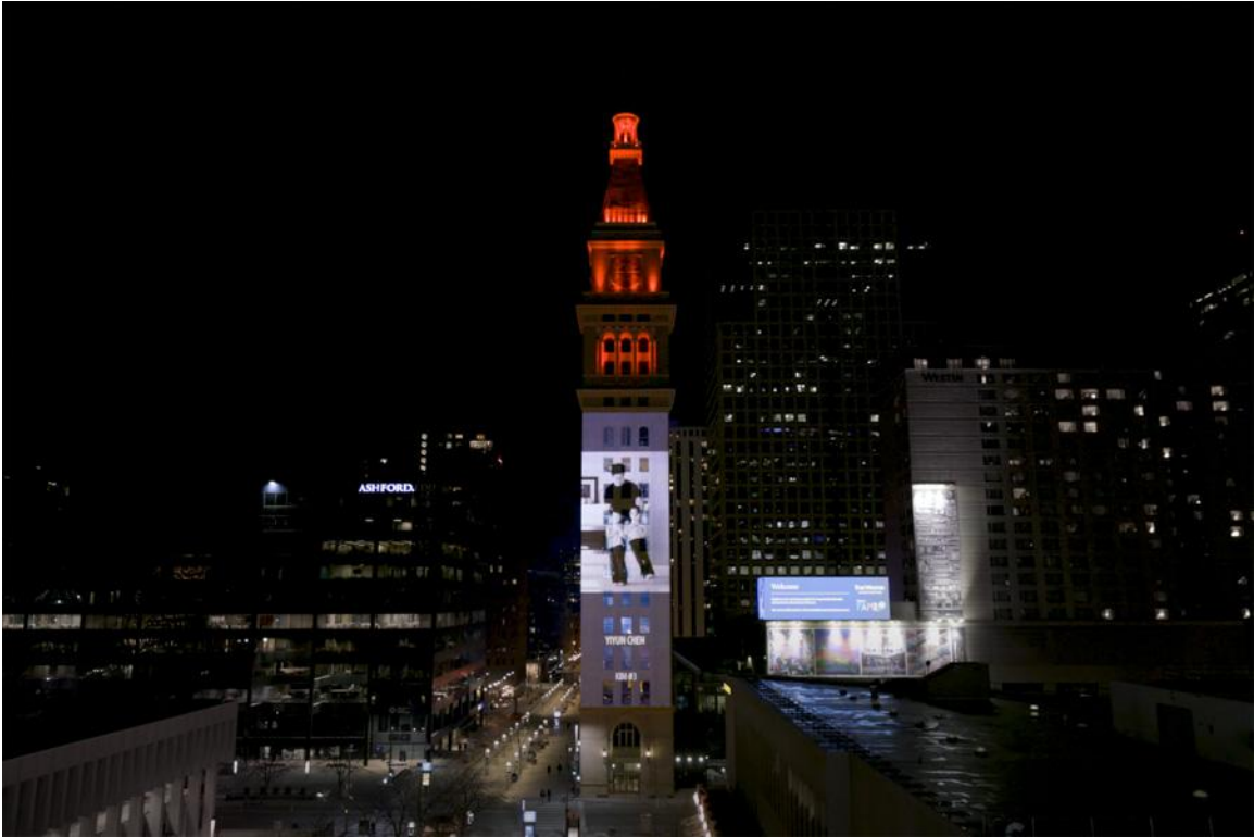
Projected on the Daniels & Fisher Tower, Colorado Photographic Arts Center, Denver, CO. 2021