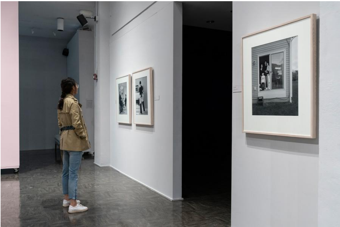
The Galleries at CSU, Cleveland, OH. 2019