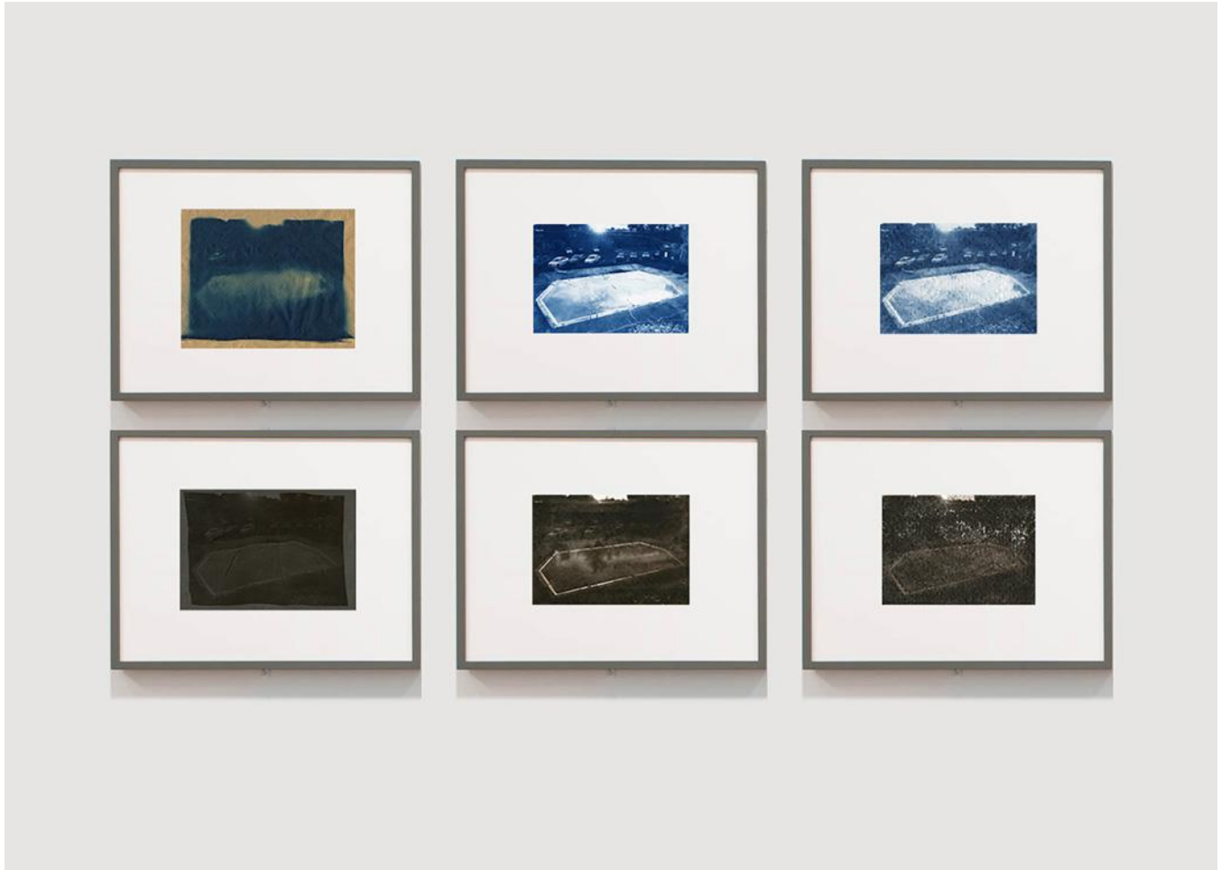
Installation View, Cleveland Institute of Art