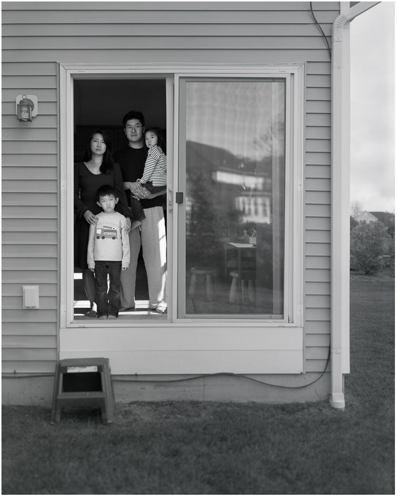
Asian American, 2014 -- 2017 Pigment Print, 30x40in