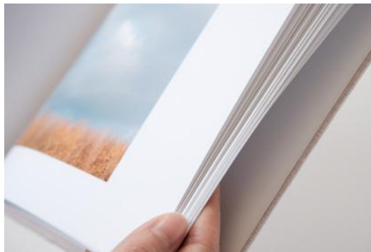
Open book, handmade photobook 8x7in, 60 pages Velleity , 2018