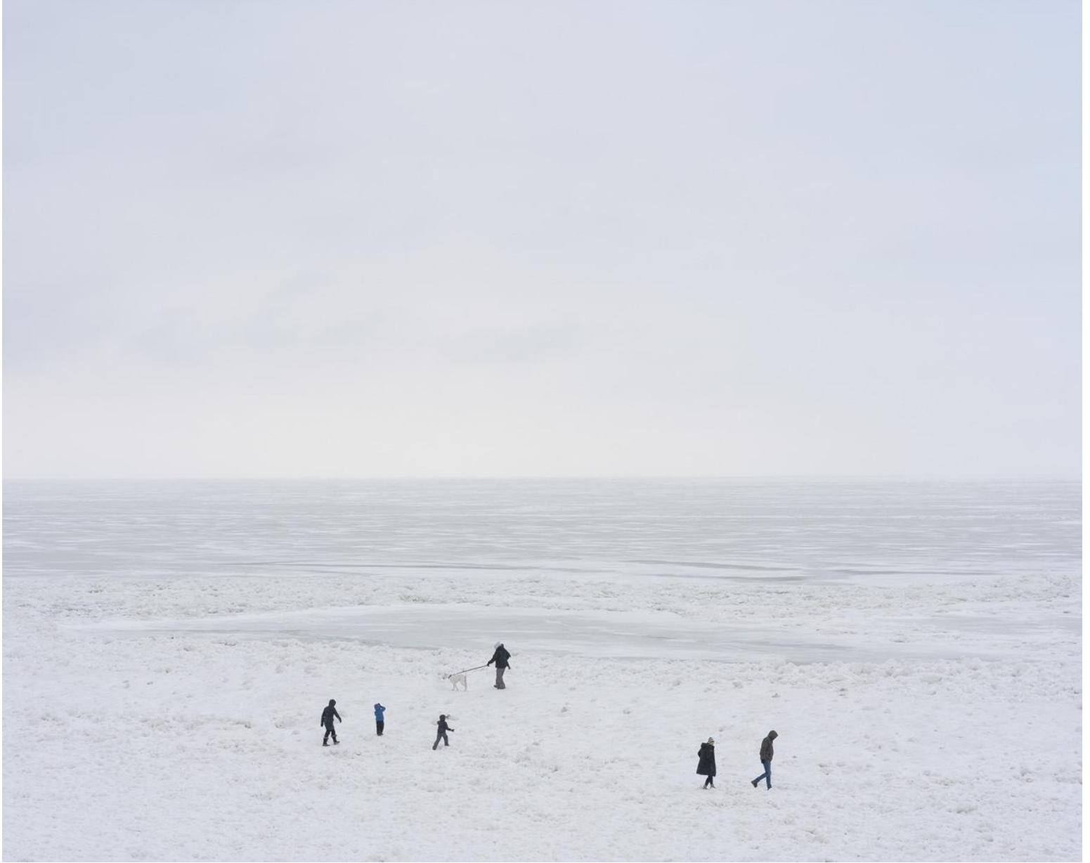
Snow Day, 2022 Pigment Print, 32x40in