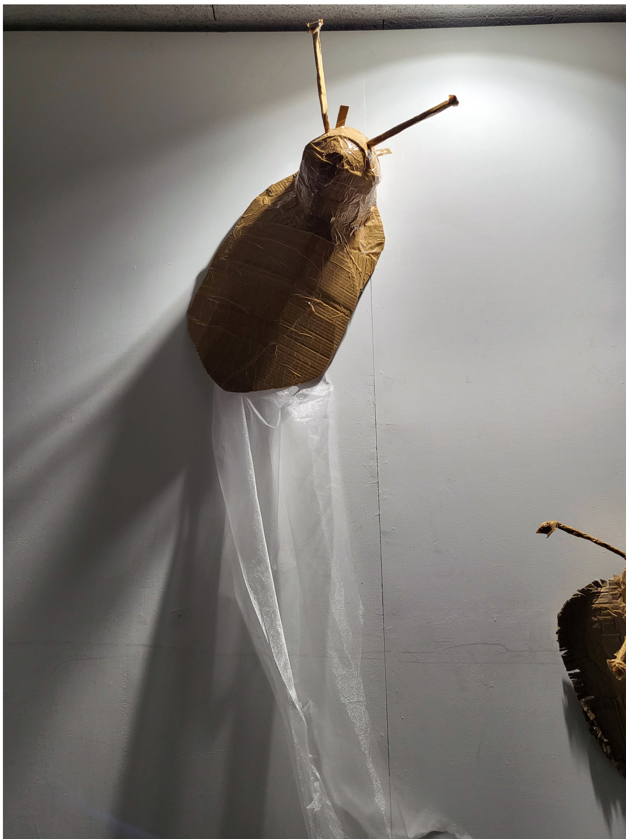
Close-up of my slug helmet. Cardboard, packing tape and white organza.