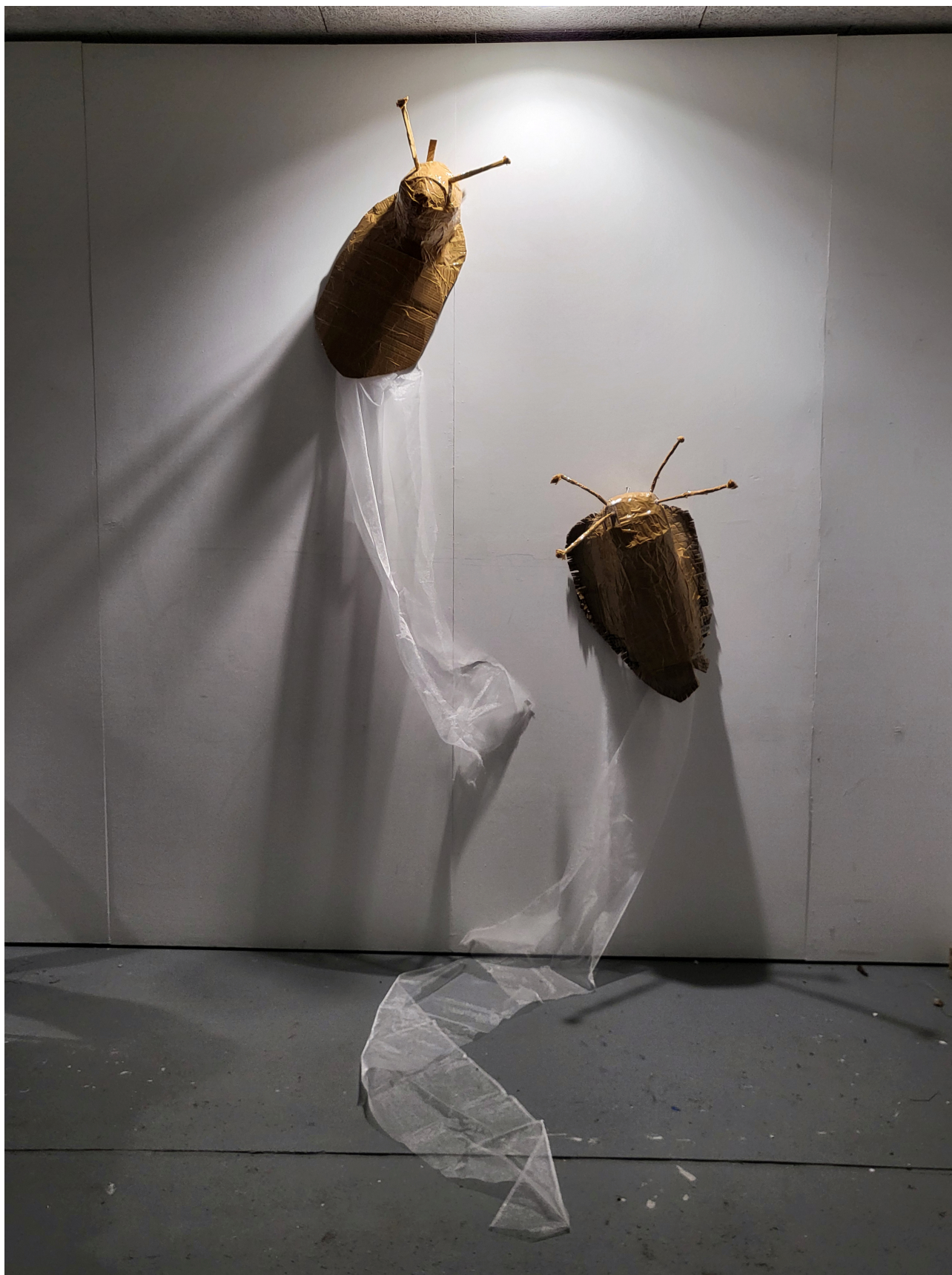
Installation shot of the slug helmets. Cardboard, packing tape and white organza.