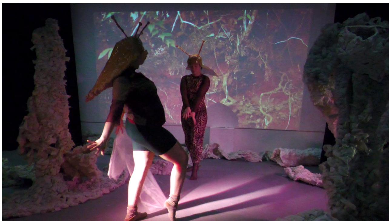
Still of Extended Joints & Strained Flesh 4/10