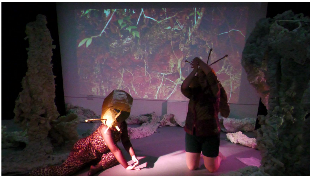
Still of Extended Joints & Strained Flesh 5/10