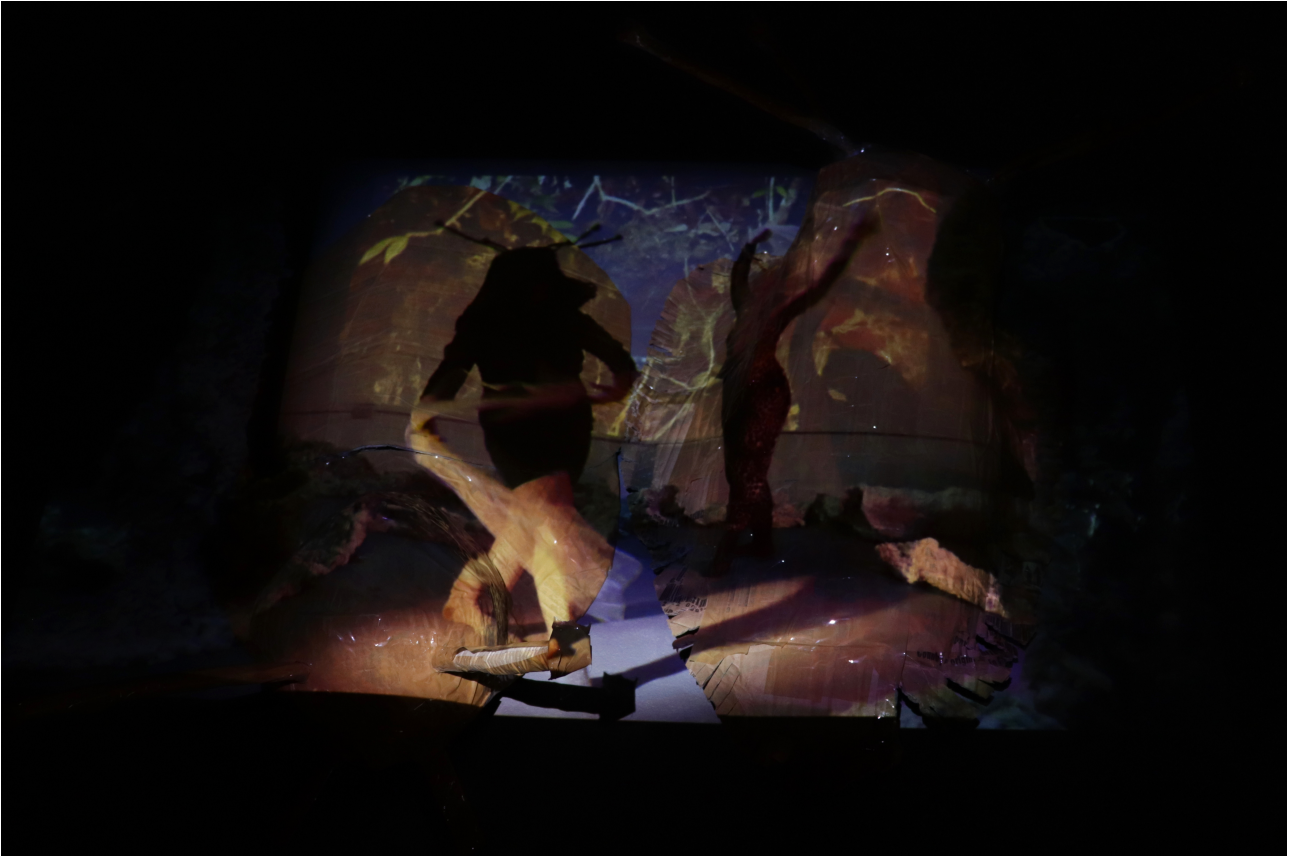
Projection Test 1b for Extended Joints & Strained Flesh : Projecting onto the Slug Helmets.