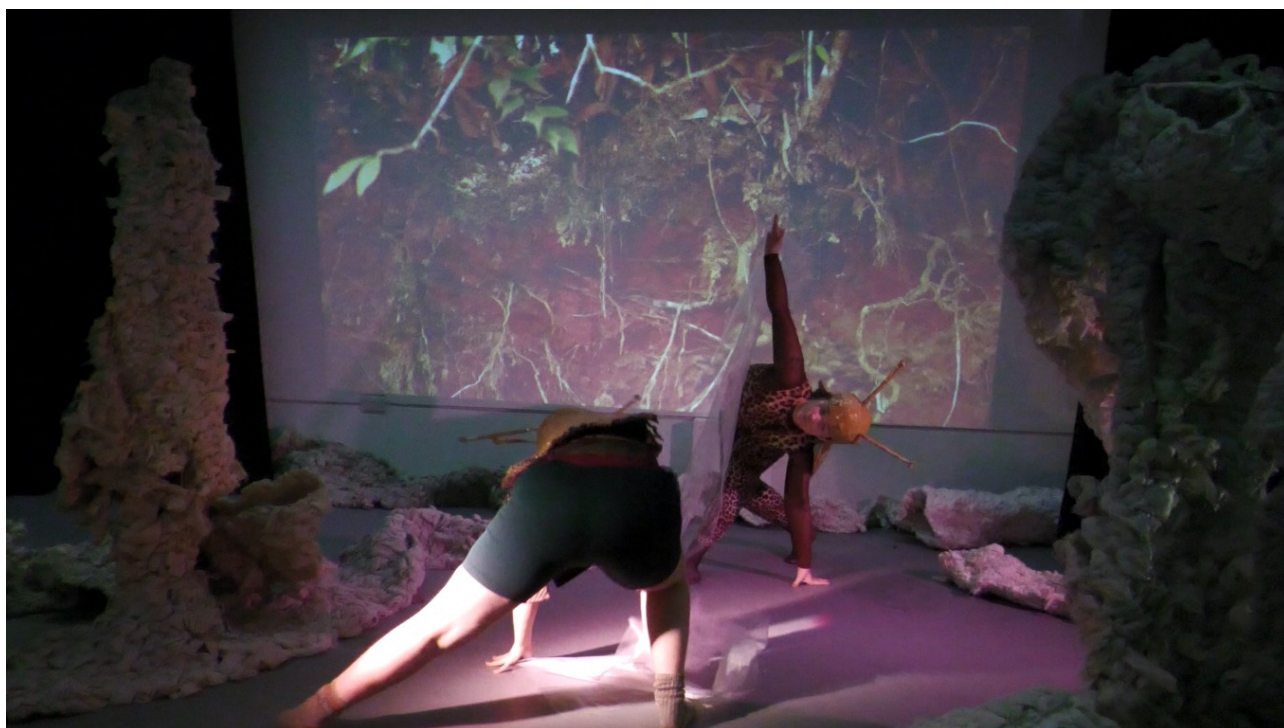
Still of Extended Joints & Strained Flesh 3/10