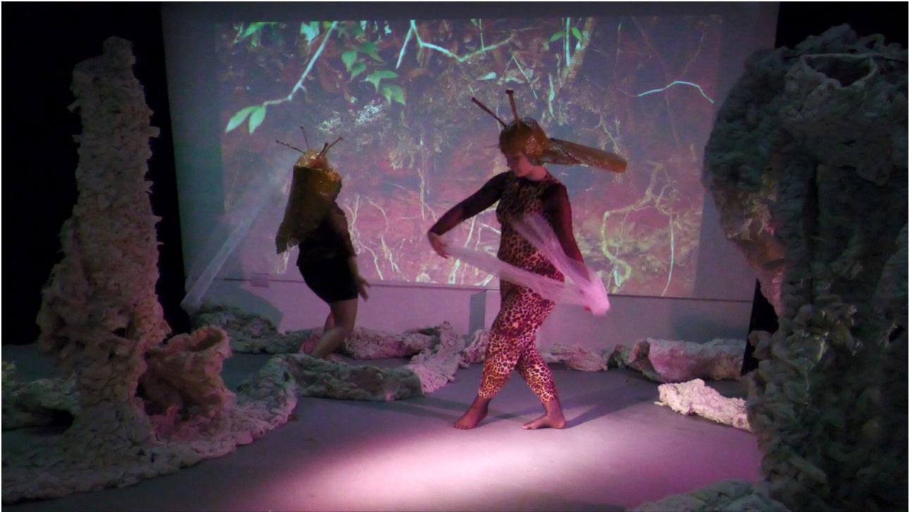
Still of Extended Joints & Strained Flesh 1/10