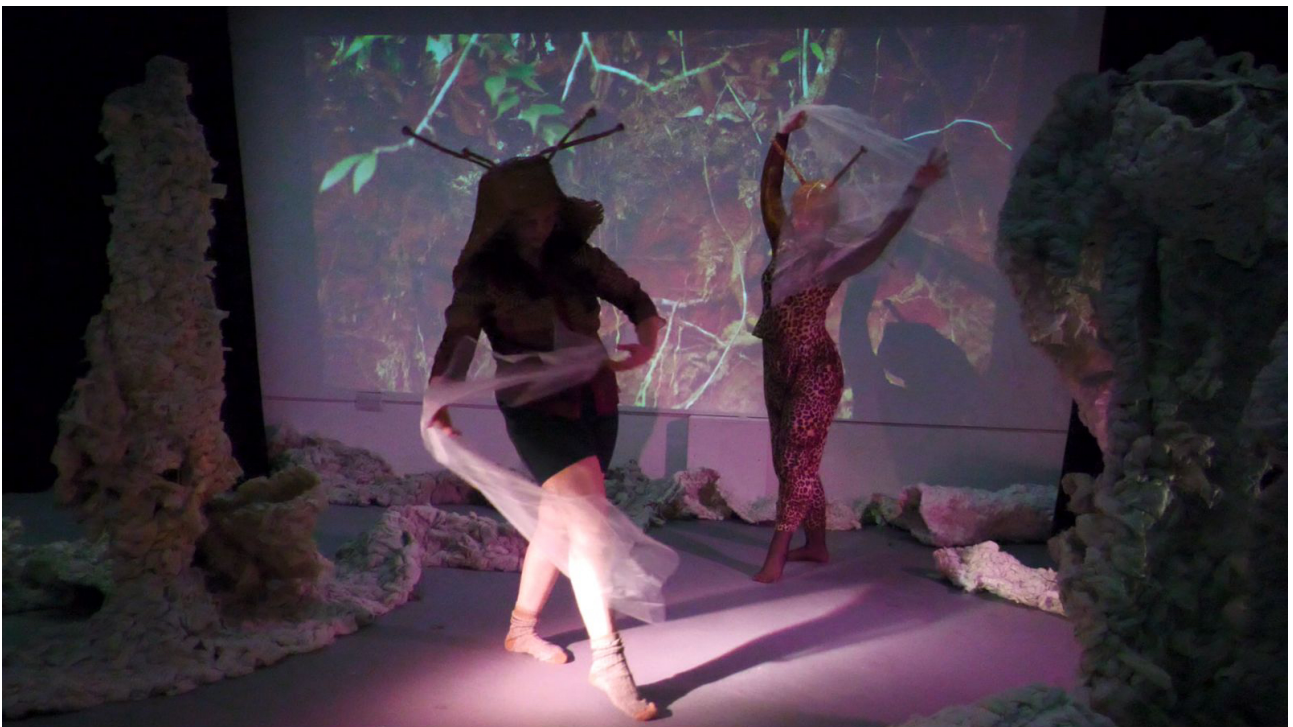
Still of Extended Joints & Strained Flesh 2/10