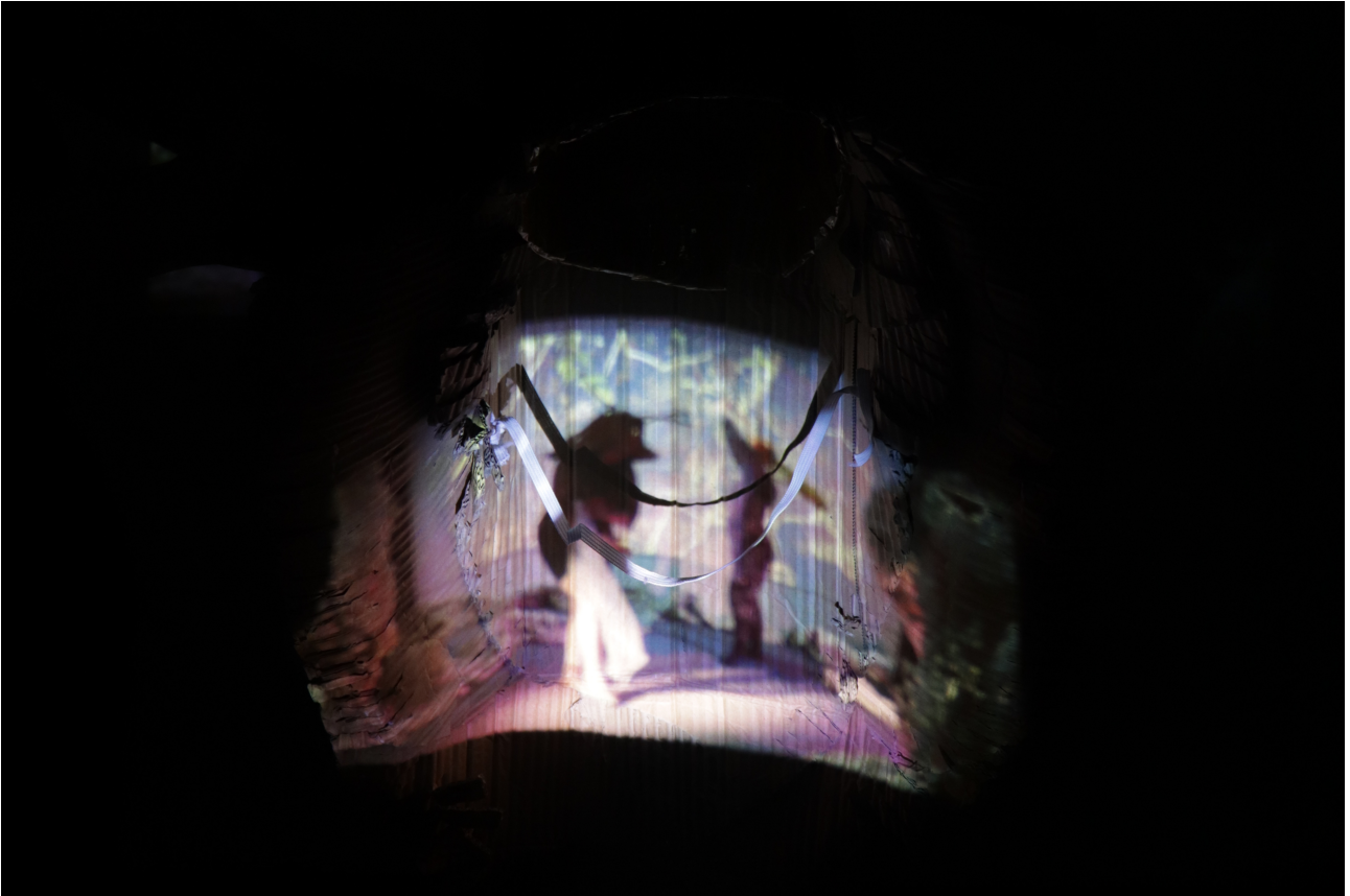
Projection Test 1a for Extended Joints & Strained Flesh : Projecting onto the Slug Helmets.