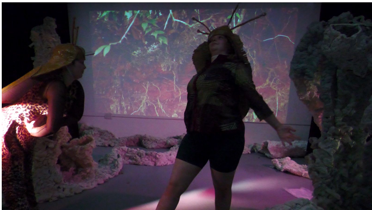
Still of Extended Joints & Strained Flesh 9/10