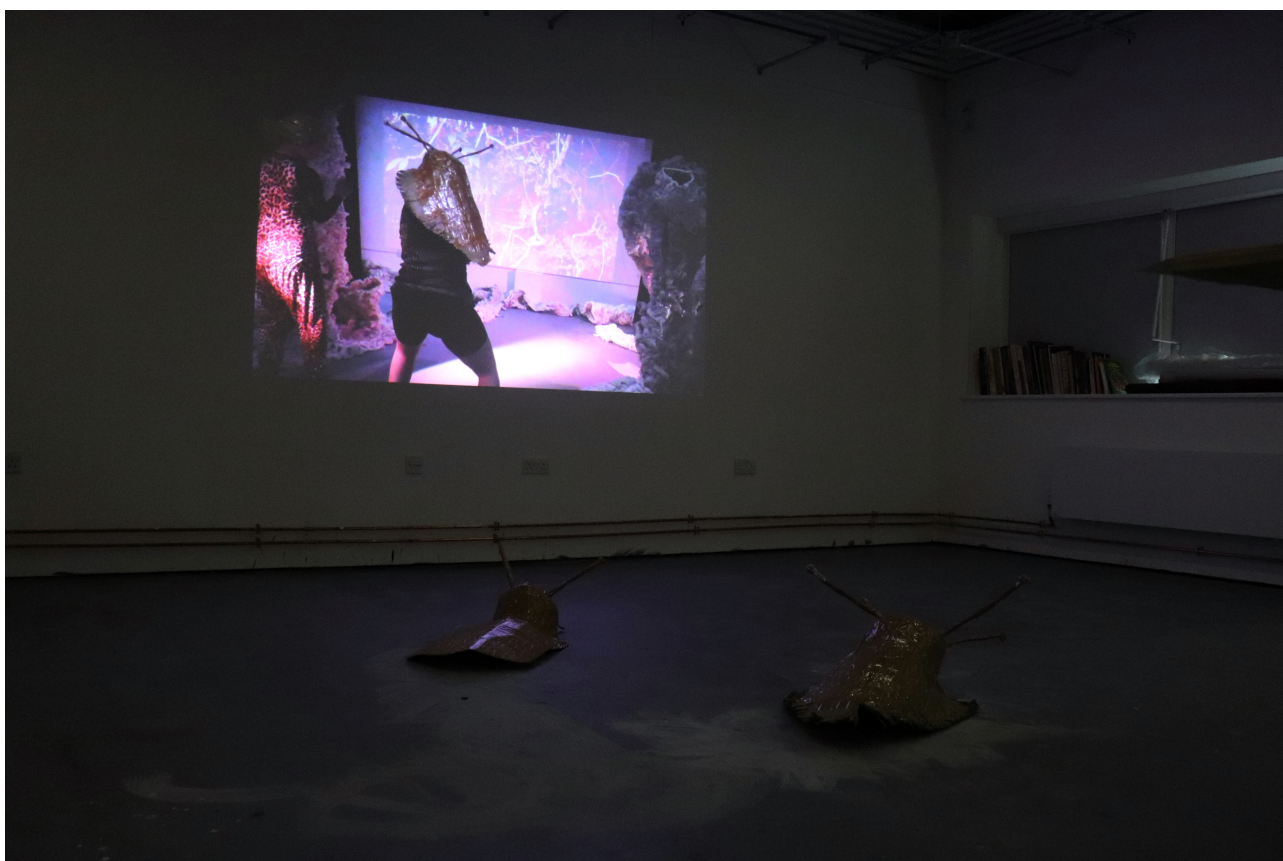
Projection Test 3 for Extended Joints & Strained Flesh : Projecting onto the wall. Slug Helmets are used as floor-based sculptures.