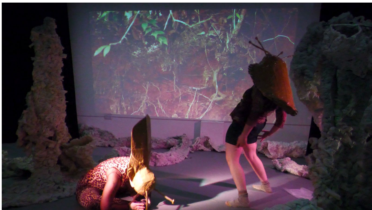
Still of Extended Joints & Strained Flesh 6/10