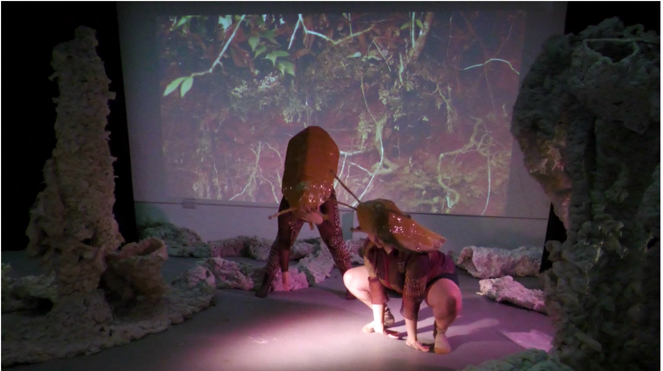
Still of Extended Joints & Strained Flesh 7/10