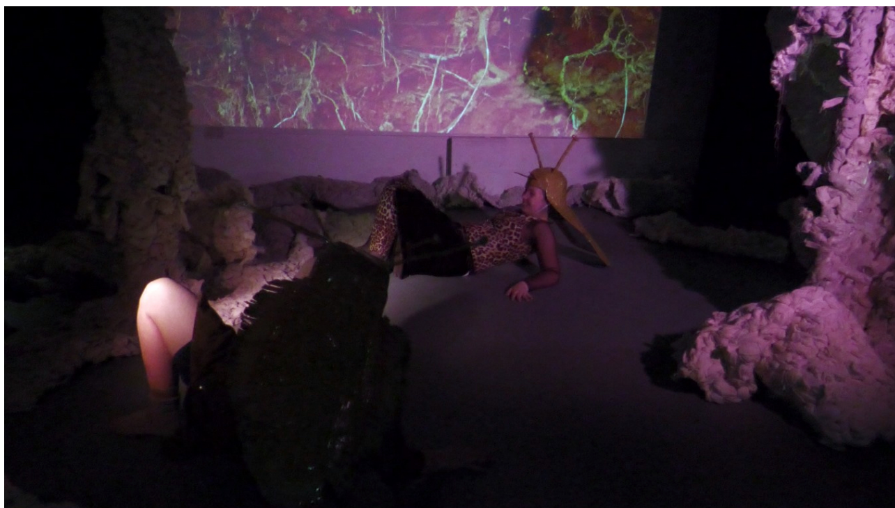
Still of Extended Joints & Strained Flesh 10/10