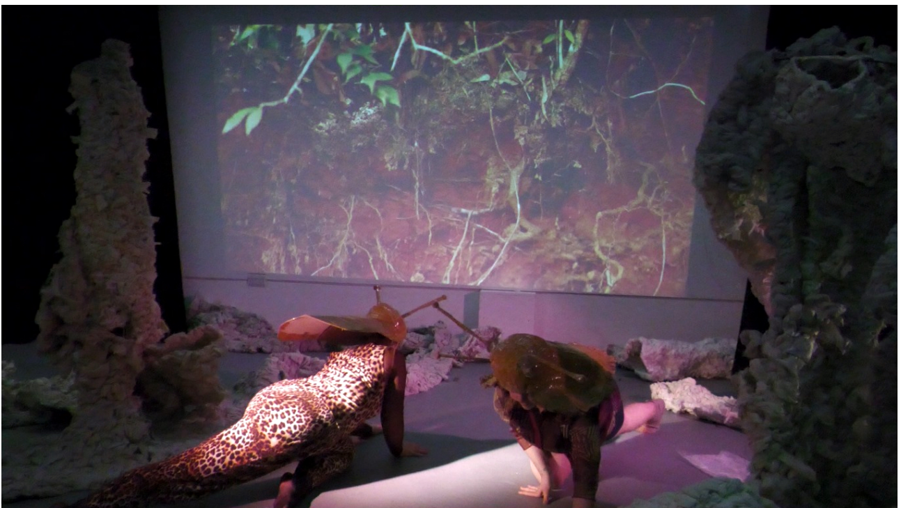
Still of Extended Joints & Strained Flesh 8/10