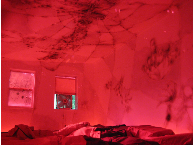
Study For Chronos XIV (Jupiter Optimus Maximus)