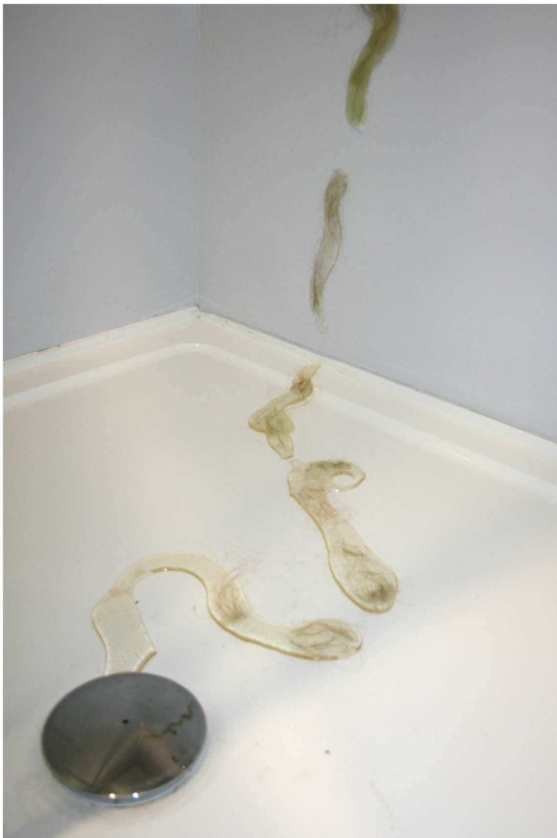
Installation shot of "Snail Trail", (March, 2025), sugar glass and human hair, dimensions variable.