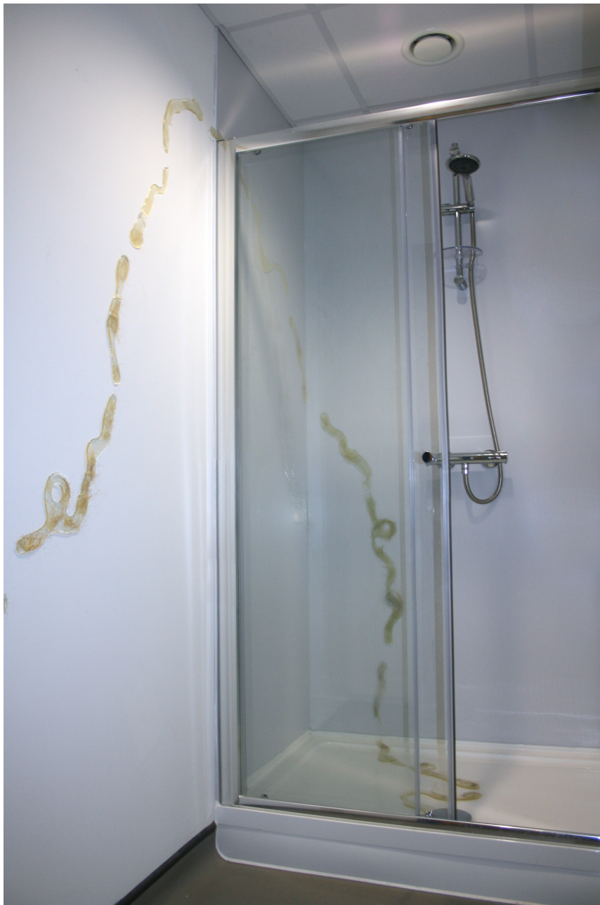
Installation shot of “Snail Trail”, (March, 2025), sugar glass and human hair, dimensions variable.

“Snail Trail” was part of the Spoon exhibition that took place on Tuesday 18th March 2025.