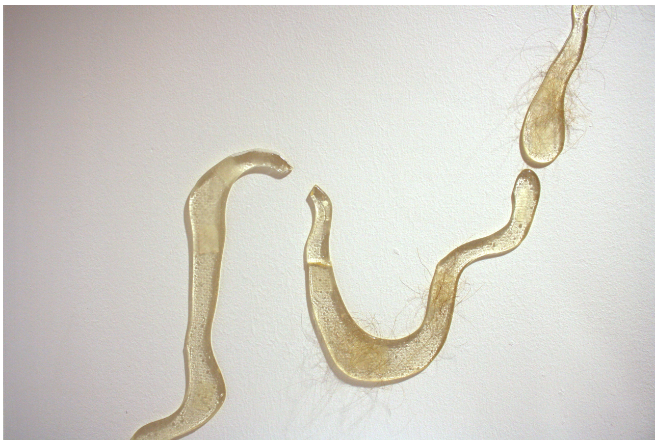
Close-up of "Snail Trail", (March 2025), sugar glass and human hair, dimensions variable.