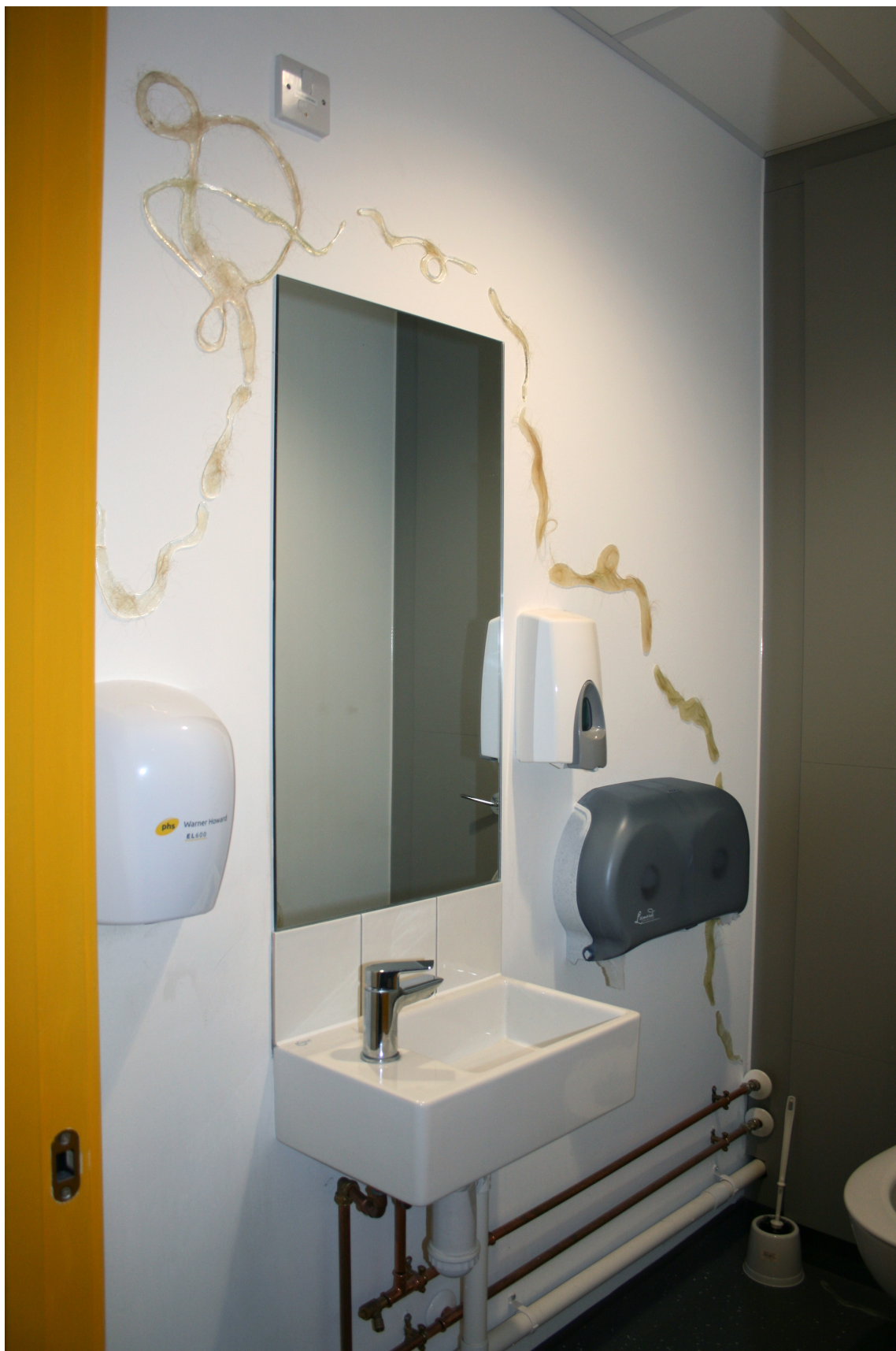
Installation shot of "Snail Trail", (March, 2025), sugar glass and human hair, dimensions variable.