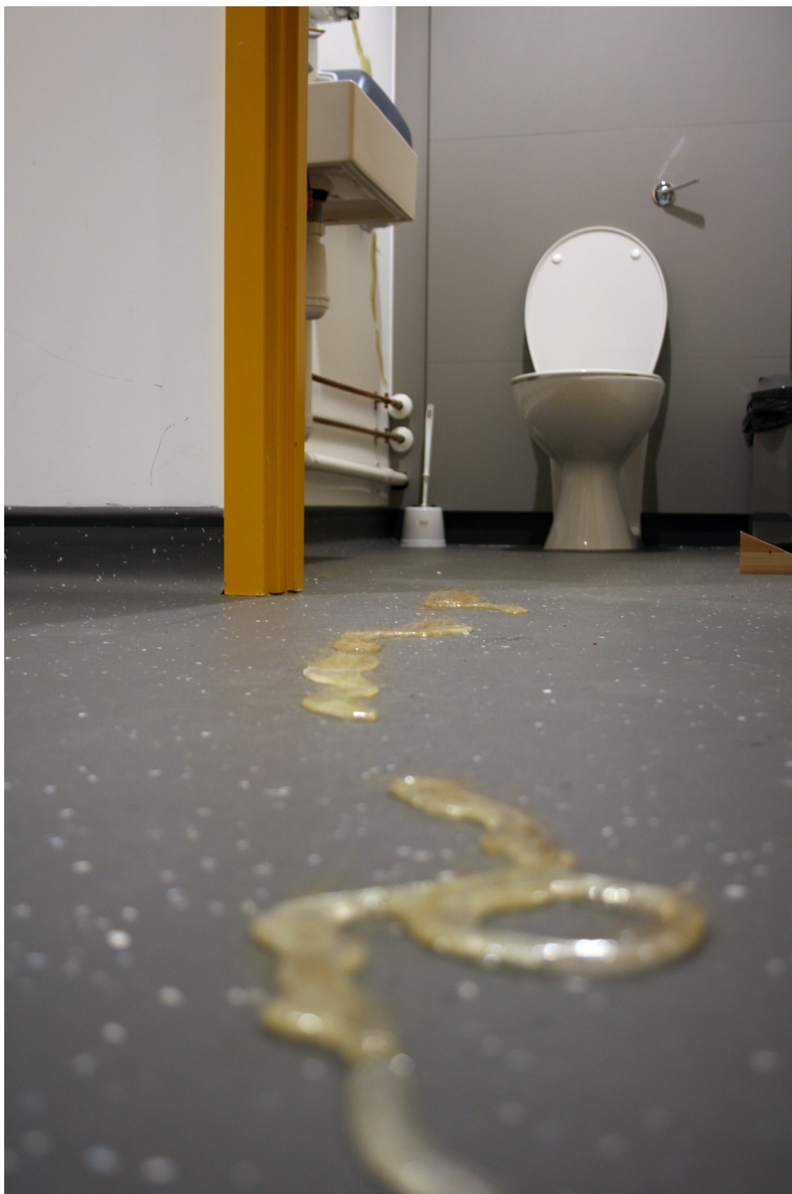
Installation shot of "Snail Trail", (March, 2025), sugar glass and human hair, dimensions variable.