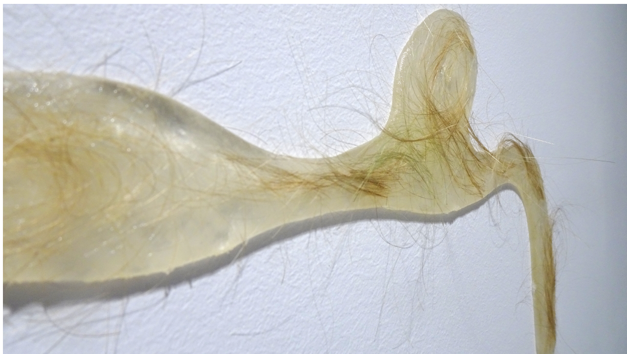
Close-up of "Snail Trail", (March 2025), sugar glass and human hair, dimensions variable.