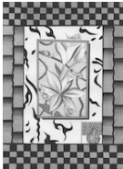
NB 8, 2022 Acrylic and ink on paper, framed, 40.5 x 29.5 cm