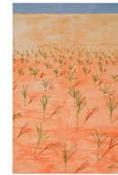
Drôle de - paysage 1, 2024 Oil and oil pastel on canvas, 90 x 130 cm