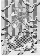
NB 3, 2022 Acrylic and ink on paper, framed, 40.5 x 29.5 cm