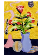
Trying to reach out, 2020 Acrylic and ink on paper, framed, 82 x 62 cm