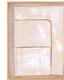
Untitled, 2024 Ceramic, Wooden Frame 90 x 130 cm