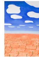
Untitled (Sol et ciel series), 2024 Oilpastel on paper, 42 x 59 cm