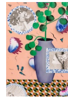
Remembering a sky, 2020 Acrylic and ink on paper, framed, 82 x 62 cm