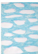
Untitled (Sol et ciel series), 2024 Oil pastel on paper, 42 x 59 cm