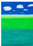
Untitled (Sol et ciel series), 2024 Oil pastel on paper, 42 x 59 cm