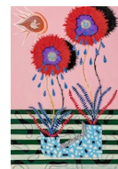
Meeting someone, 2020 Acrylic and ink on paper, framed, 82 x 62 cm