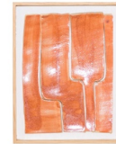
Untitled, 2024 Ceramic, Wooden Frame 127 x 157 x 20 mm