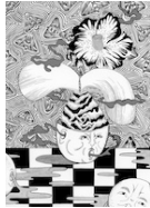
NB 4, 2022 Acrylic and ink on paper, framed, 40.5 x 29.5 cm