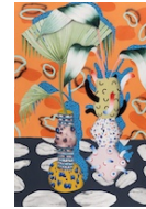
Waterful ring toss, 2020 Acrylic and ink on paper, framed, 82 x 62 cm