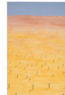
Drôle de - paysage 2, 2024 Oil and oil pastel on canvas, 90 x 130 cm