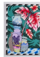
Soleil de sieste, 2022 Acrylic and ink on paper mounted on wood, 118 x 81 cm