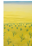
Untitled (Sol et ciel series), 2024 Oilpastel on paper, 42 x 59 cm