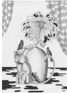
NB 1, 2022 Acrylic and ink on paper, framed, 40.5 x 29.5 cm