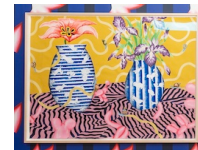
Après la fête, 2022 Acrylic and ink on paper, framed, 120 x 159 cm