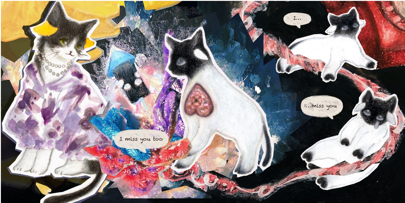
I Miss You Too, Mama

Traditional art on the paper, edited by procreate, 18 cm*36 cm