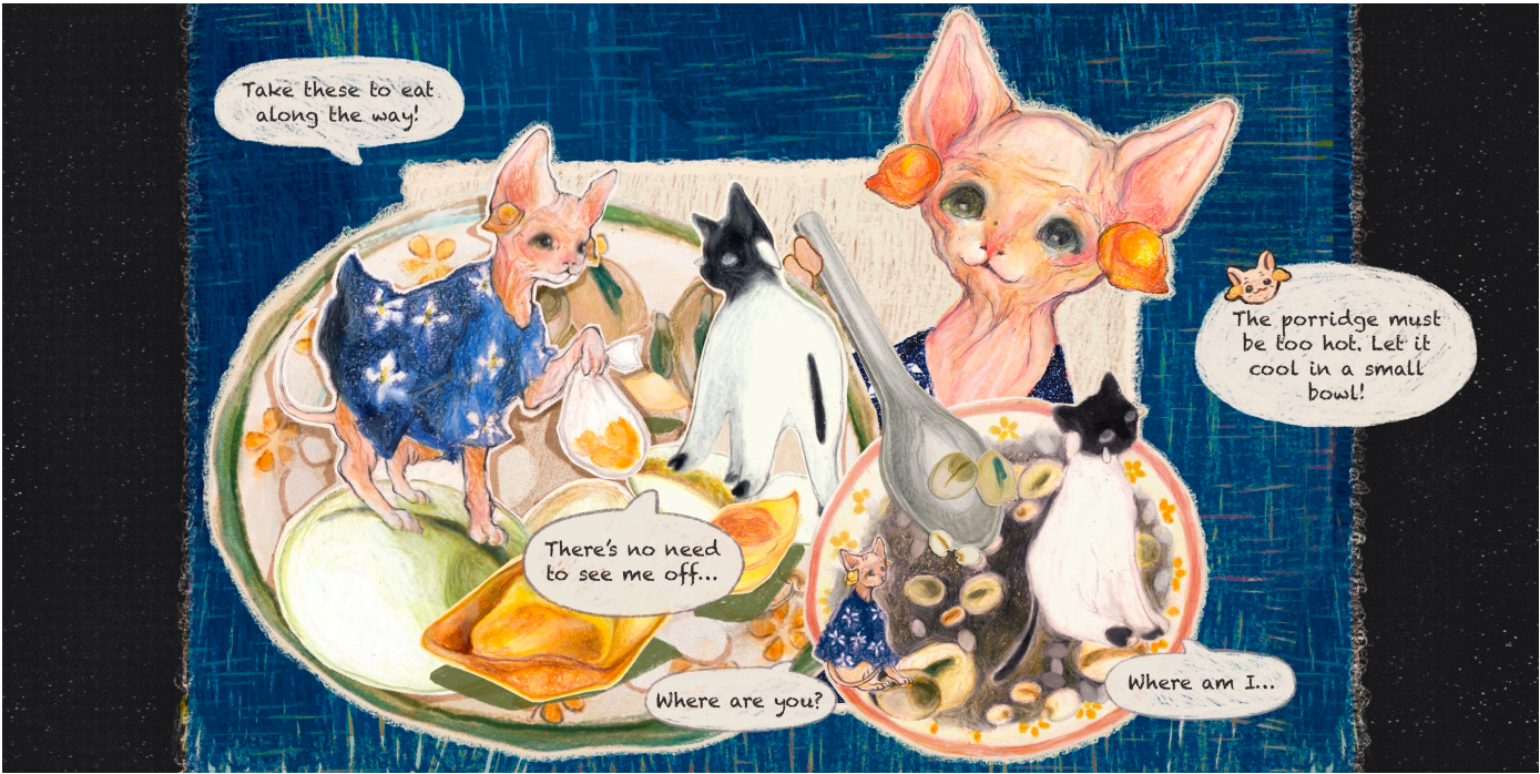
Grandma's Old Recipe

Traditional art on the paper, edited by procreate, 18 cm*36 cm