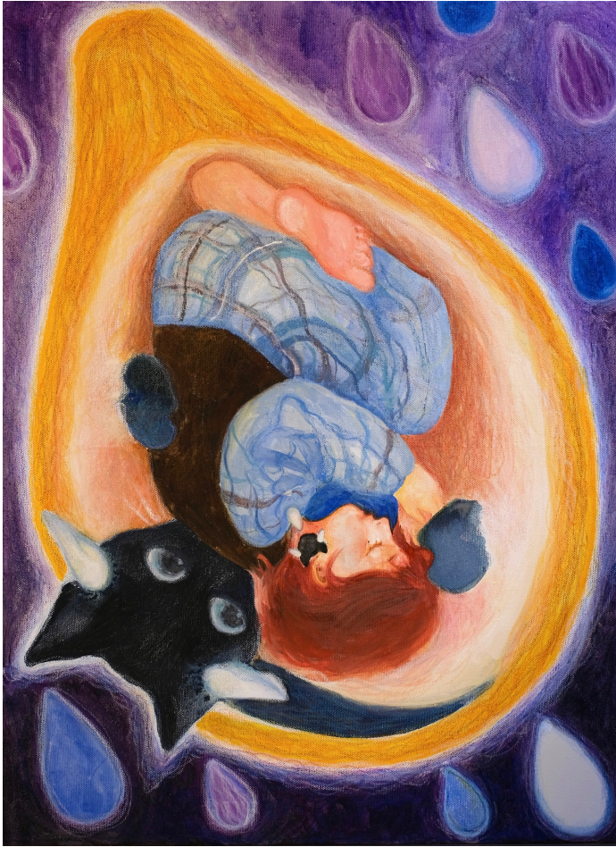
Hold me tight in an almond Acrylic on canvas, 60 x 45 cm