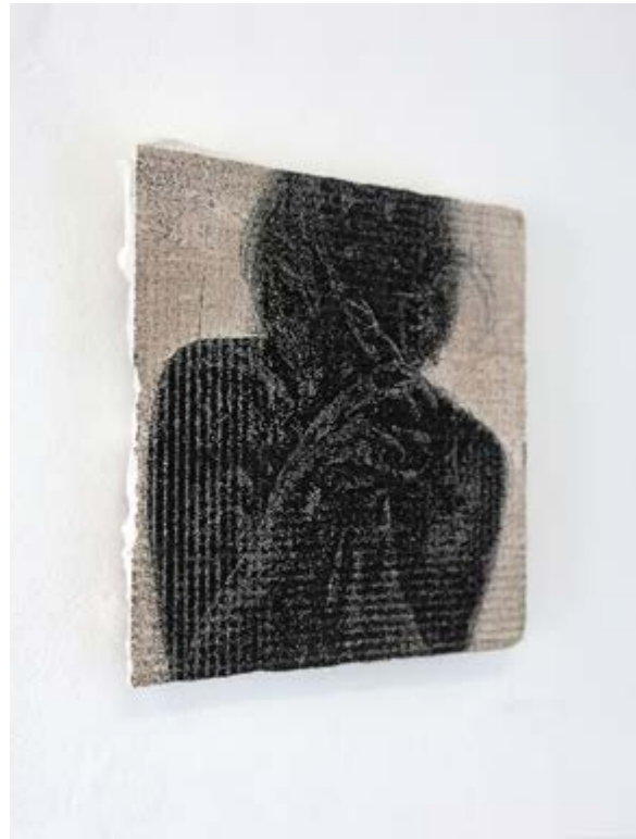
Annabelle McEwen - Data Composite, 2024