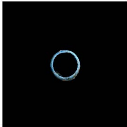
Brian Skinner - A Pale Blue Dot, 2024