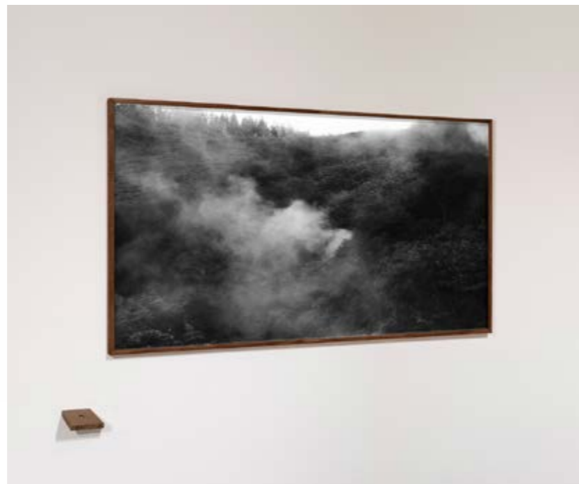
Melanie Cobham - The Death of Images, 2024